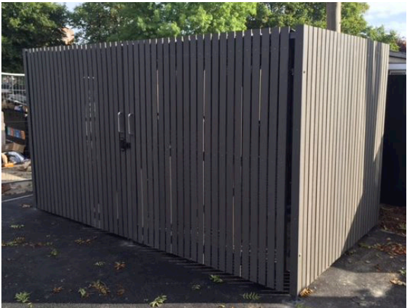
SECURE ENCLOSED CYCLE STORAGE UNIT NOTE: IMAGE SHOWN AS REFERENCE ONLY