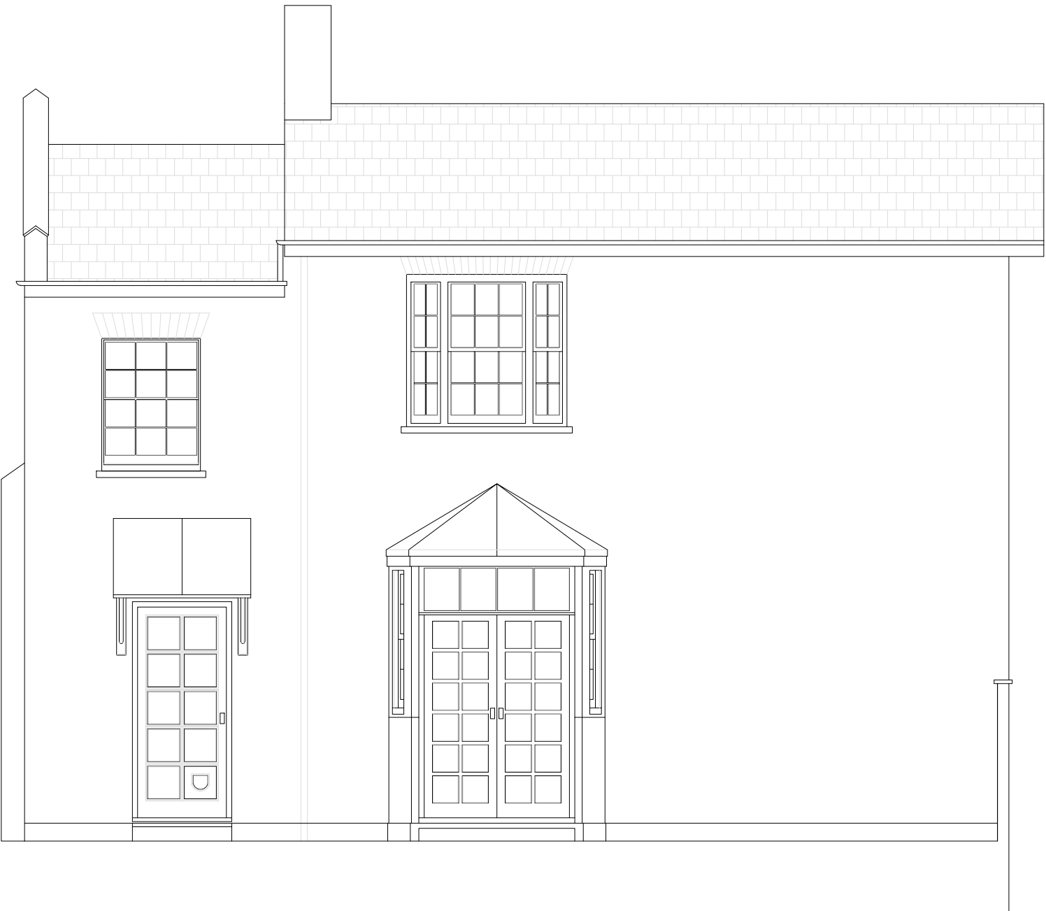
Side Elevation n.2