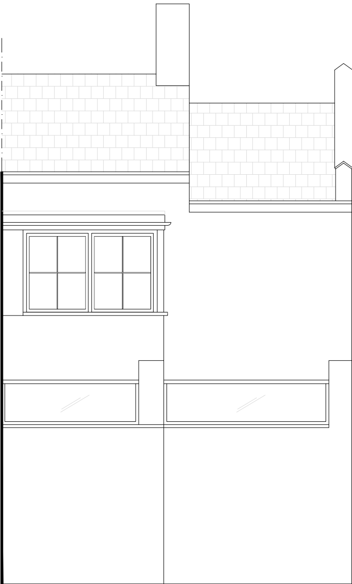
Rear Elevation n.3 No access to rear elevation