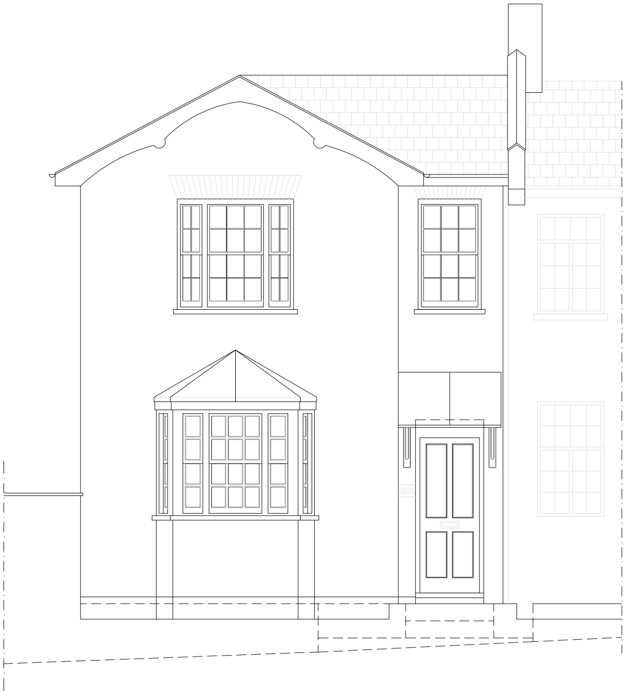
Front Elevation Vale of Health / n.1