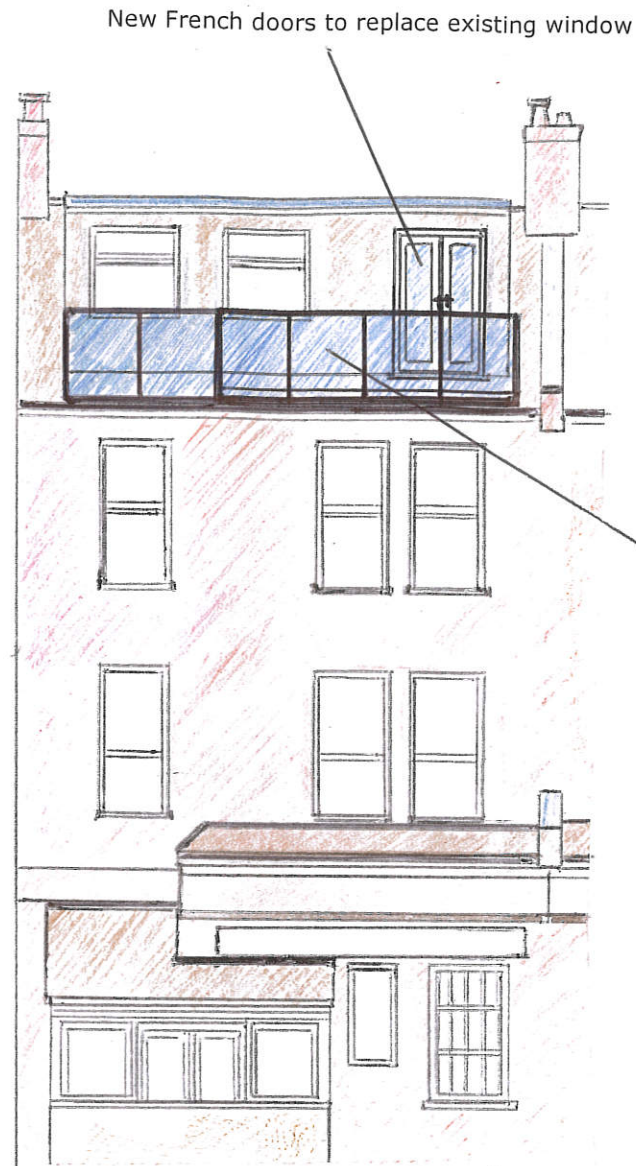
Proposed Rear Elevation View

Installation of French doors and small balcony detail