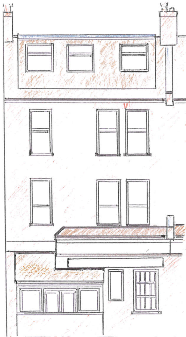
Existing Rear Elevation View

Flat 4 13 St Cuthbert's Road, London. NW2 3QJ.