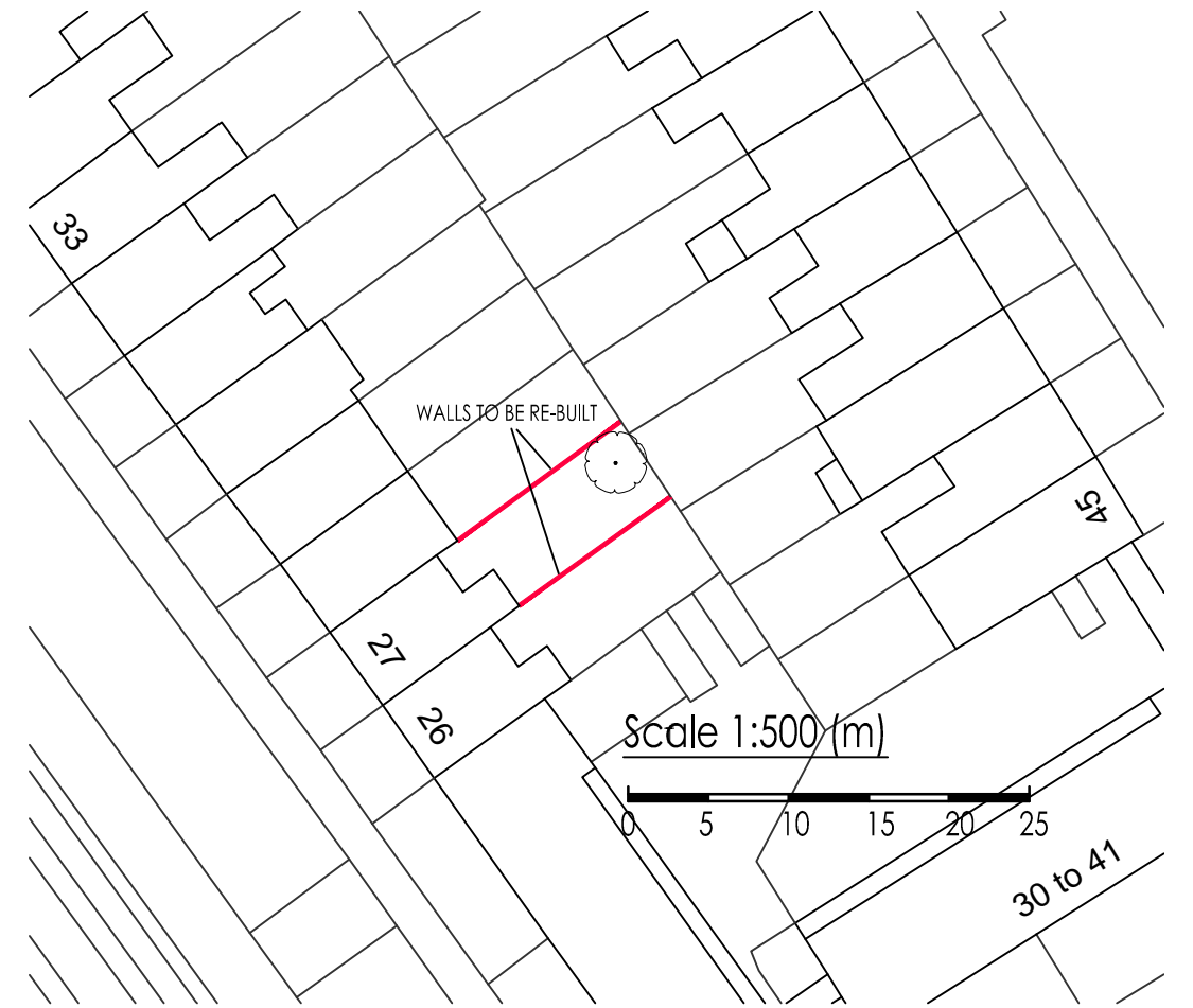
BLOCK PLAN 1:500 scale