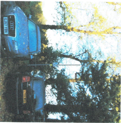
LOCATION B WITH POLE