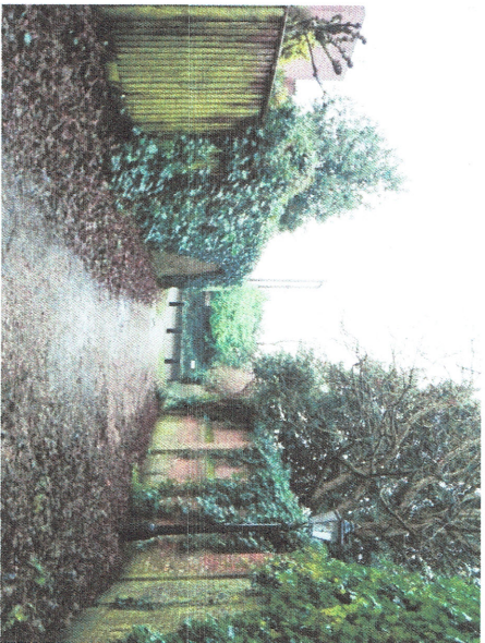
LOCATION D WITHOUT POLE