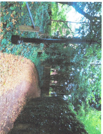
LOCATION C WITH POLE