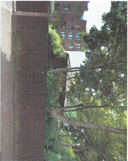
LOCATION A WITHOUT POLE