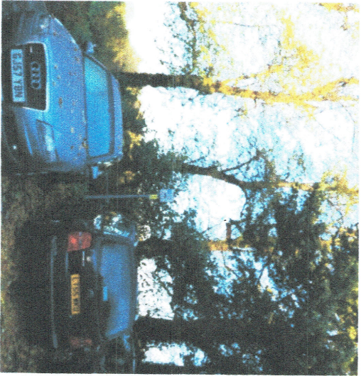
LOCATION B WITHOUT POLE

A 3.5-metre high pole adjacent to the flank wall of Cappo do Monte with a wire connecting to a replacement 3.5 metre high parking pole and, using 1.6mm clear nylon wire to accommodate adjacent trees, extend to a third pole adjacent to the third timber post beyond the lampost on the north side of Judges Walk and the final pole adjacent to the wall of Summit Lodge within the overhanging ivy. Refix parking sign as previously to pole B.