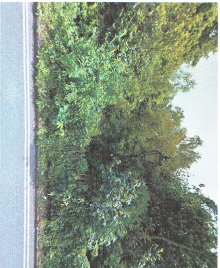
LOCATION B WITHOUT POLE