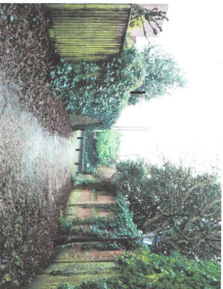
LOCATION D WITH POLE