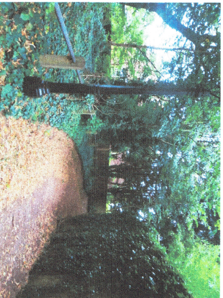
LOCATION C WITHOUT POLE