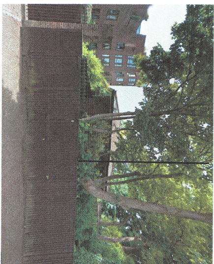
LOCATION A WITH POLE