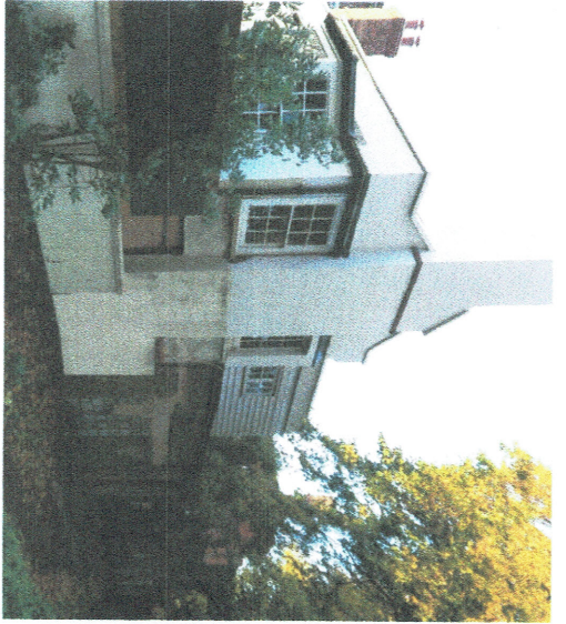
LOCATION A WITHOUT POLE