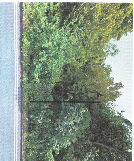
LOCATION B WITH POLE