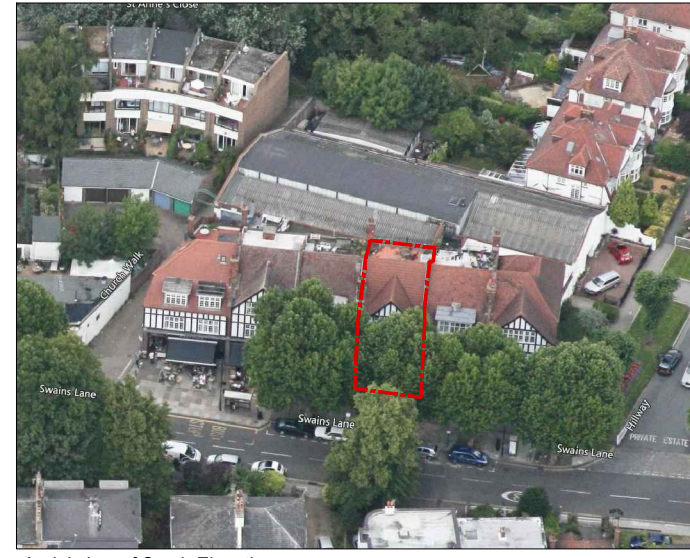
Aerial view of South Elevation