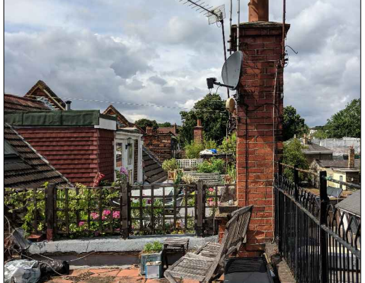
Roof terrace and rear dormer to residential unit at no. 19C Swain's Lane