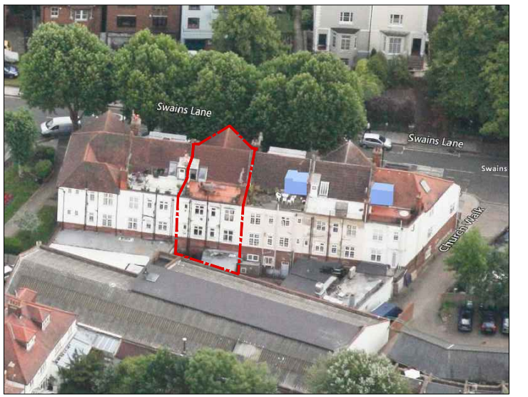
Aerial view of North Elevation