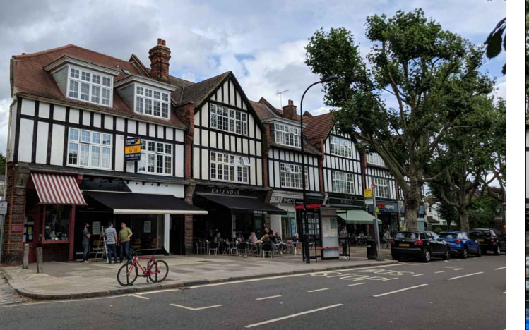
Streetscene Perspective of 21 Swain's Lane