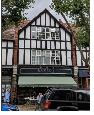
Streetscene Perspective of 21 Swain's Lane