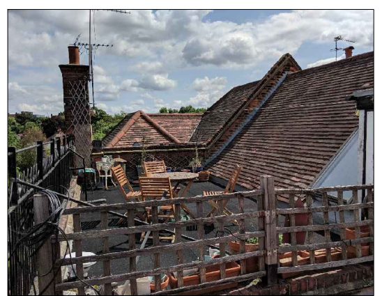
Roof terrace to residential unit at no. 23 Swain's Lane