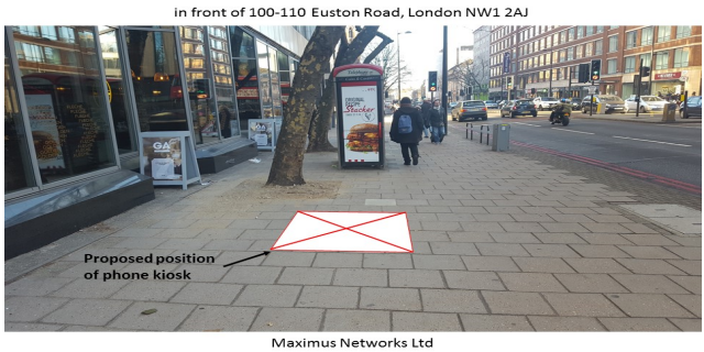
Maximus Networks Ltd