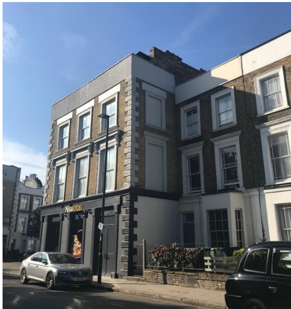
Image 4. The Building. Photograph showing the prominence of the building adjacent contemporary terrace houses.