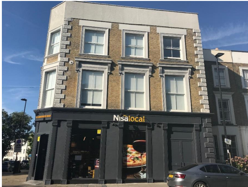
Image 1. The Building. Photograph of the Brecknock Road elevation.