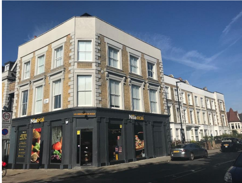
Image 3. The Building. Photograph of the Building.