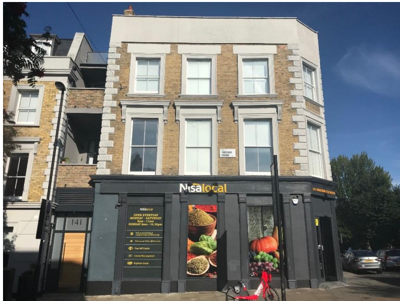
Image 2. The Building. Photograph of the Torriano Avenue elevation