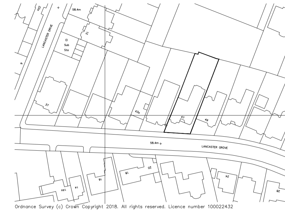
1 : 1250 LOCATION PLAN