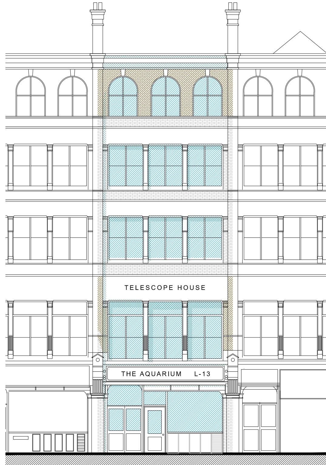
1 Existing East Elevation