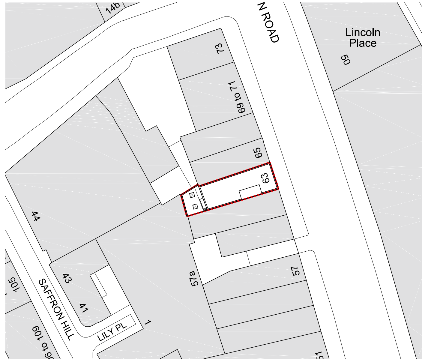
2 Block Plan 1:500