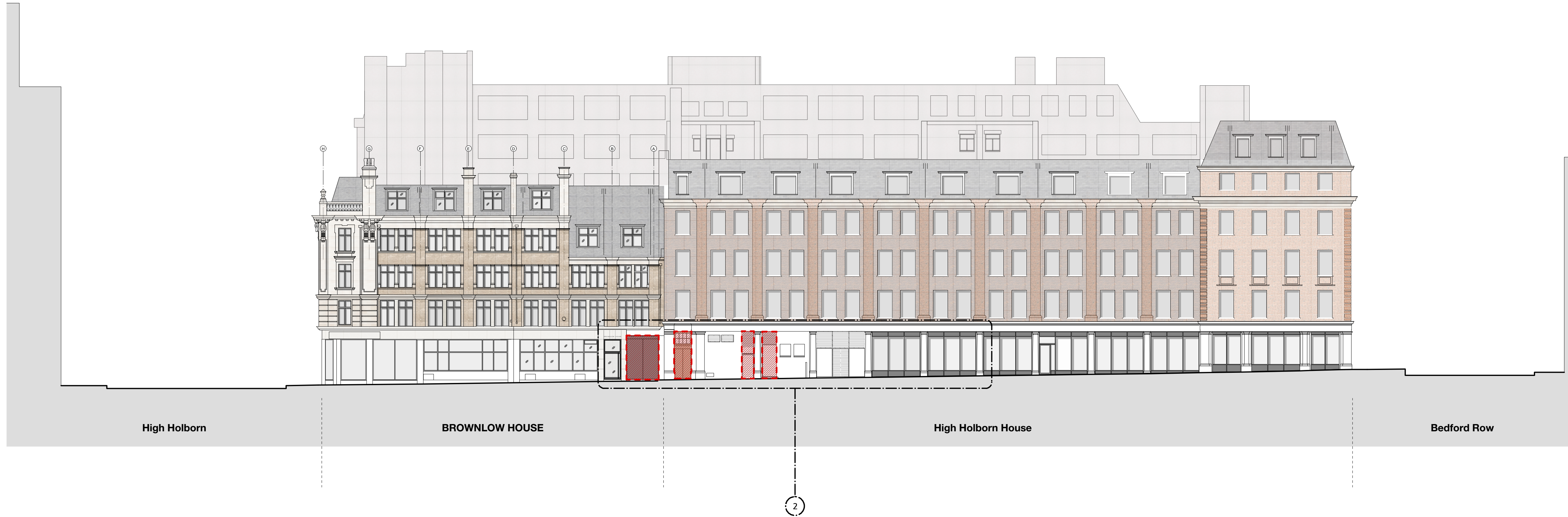
1 Demolition Elevation/ Brownlow Street 1:200 @ A1/1:400 @ A3