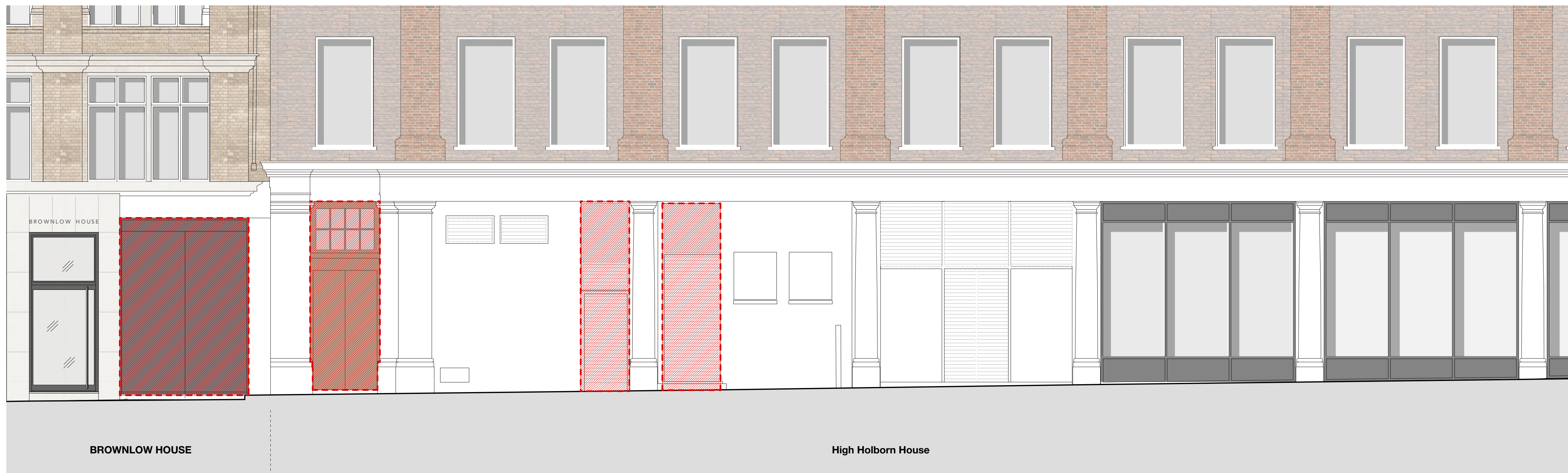
2 Demolition Elevation/Detail View 1:50 @ A1/1:100 @ A3

GENERAL NOTES: All dimensions to be checked on site prior to commencement of any works, and/or preparation of any shop drawings. Sizes of and dimensions to any structural elements are indicative only. See structural engineers drawings for actual sizes / dimensions. Sizes of and dimensions to any service elements are indicative only. See service engineers drawings for actual sizes and dimensions. This drawing to be read in conjunction with all other Architect's drawings, specifications and other Consultants' information. All proprietary systems shown on this drawing are to be installed strictly in accordance with the Manufacturers/Suppliers recommended details. Any discrepancies between information shown on this drawing and any other contract information or manufacturers/suppliers recommendations is to be brought to the attention of the Architect DO NOT SCALE FROM THIS DRAWING.