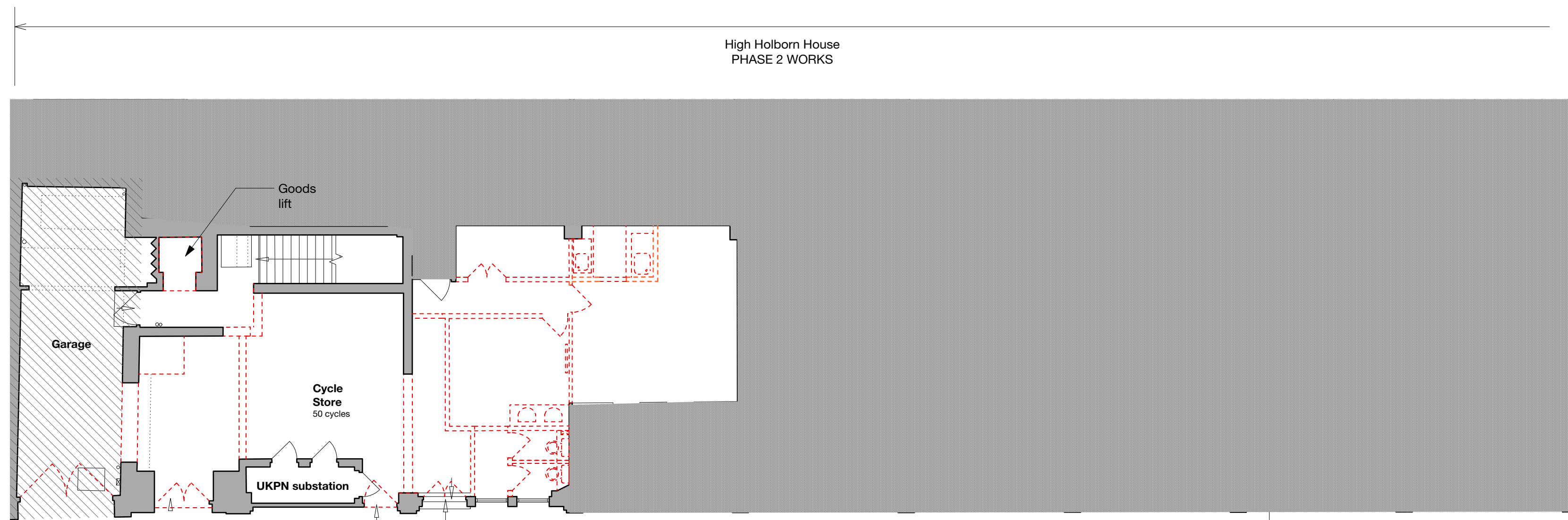
2 High Holborn House Demolition Ground Floor Scale: 1:100

GENERAL NOTES: All dimensions to be checked on site prior to commencement of any works, and/or preparation of any shop drawings. Sizes of and dimensions to any structural elements are indicative only. See structural engineers drawings for actual sizes / dimensions. Sizes of and dimensions to any service elements are indicative only. See service engineers drawings for actual sizes and dimensions. This drawing to be read in conjunction with all other Architect's drawings, specifications and other Consultants' information. All proprietary systems shown on this drawing are to be installed strictly in accordance with the Manufacturers/Suppliers recommended details. Any discrepancies between information shown on this drawing and any other contract information or manufacturers/suppliers recommendations is to be brought to the attention of the Architect DO NOT SCALE FROM THIS DRAWING.