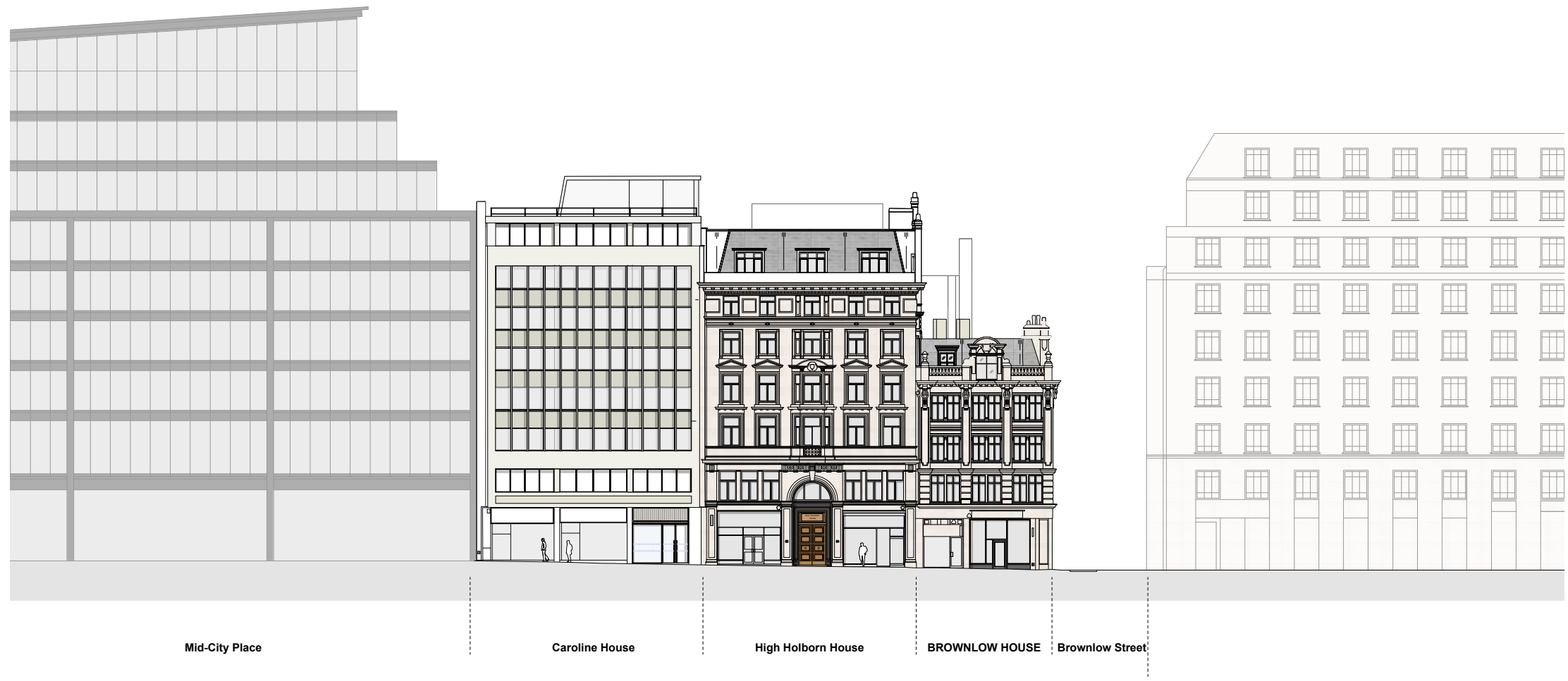
1 Proposed Elevation A-A / High Holborn 1:200 at A1