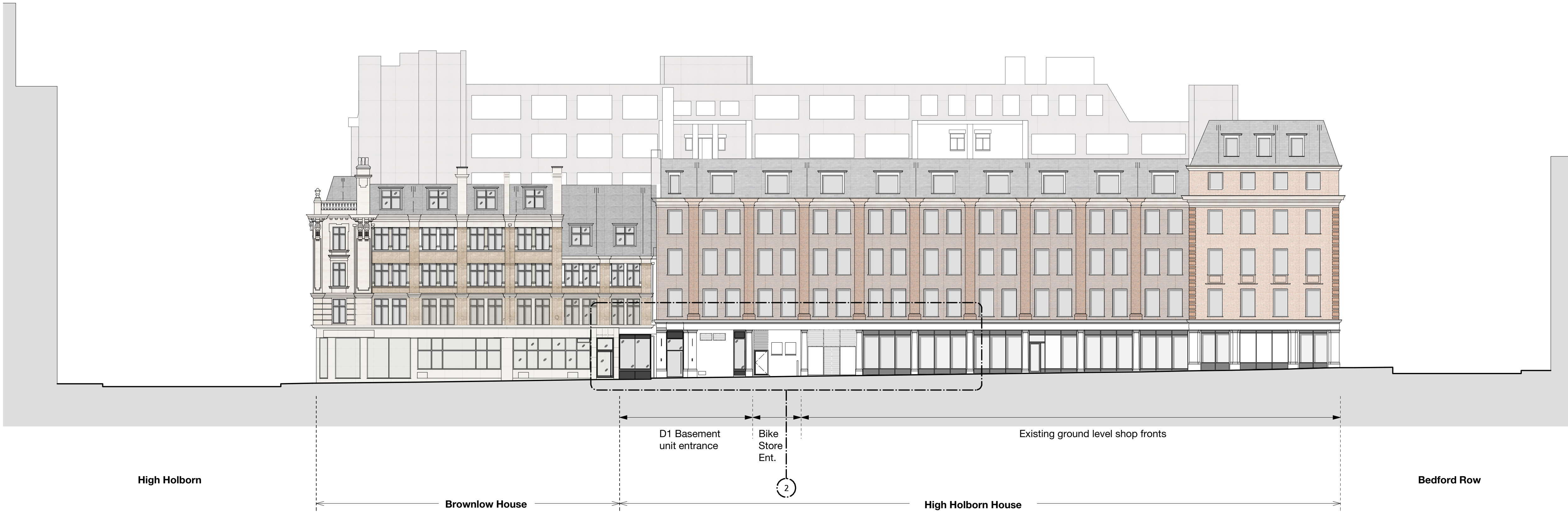
1 Proposed Elevation / Brownlow Street 1:200 at A1