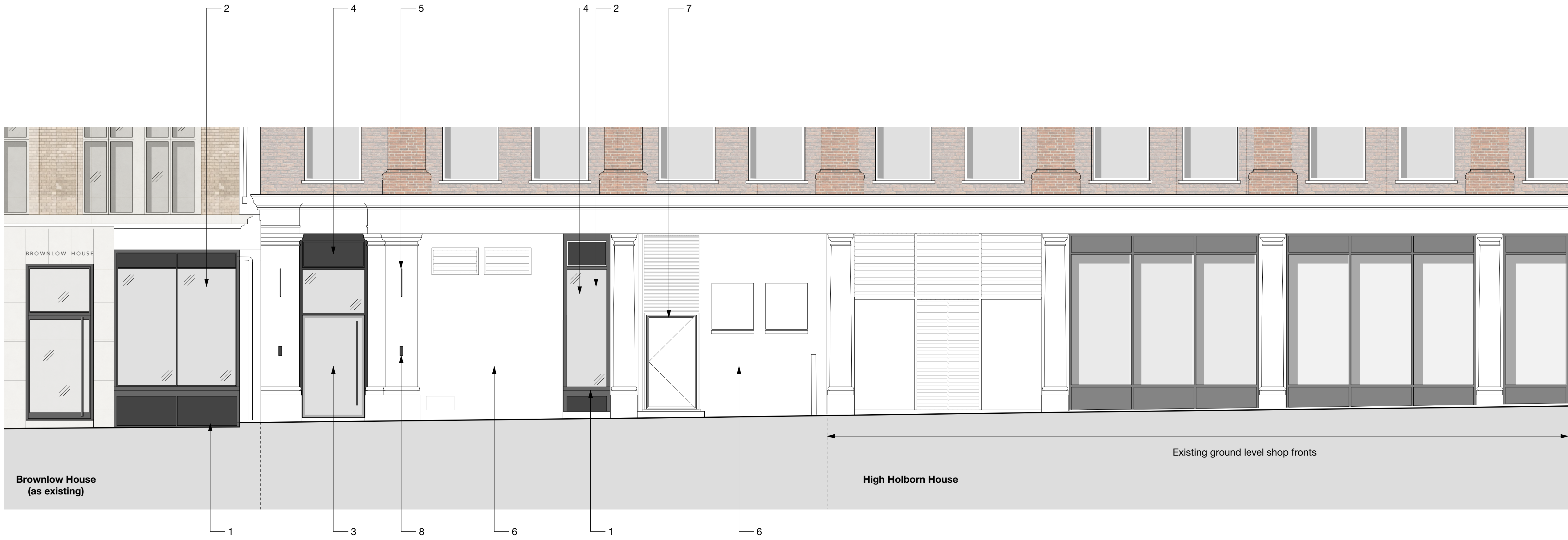
2 Proposed Elevation to Basement Entrance 1:50 at A1

GENERAL NOTES: All dimensions to be checked on site prior to commencement of any works, and/or preparation of any shop drawings. Sizes of and dimensions to any structural elements are indicative only. See structural engineers drawings for actual sizes / dimensions. Sizes of and dimensions to any service elements are indicative only. See service engineers drawings for actual sizes and dimensions. This drawing to be read in conjunction with all other Architect's drawings, specifications and other Consultants' information. All proprietary systems shown on this drawing are to be installed strictly in accordance with the Manufacturers/Suppliers recommended details. Any discrepancies between information shown on this drawing and any other contract information or manufacturers/suppliers recommendations is to be brought to the attention of the Architect DO NOT SCALE FROM THIS DRAWING. NOTES.