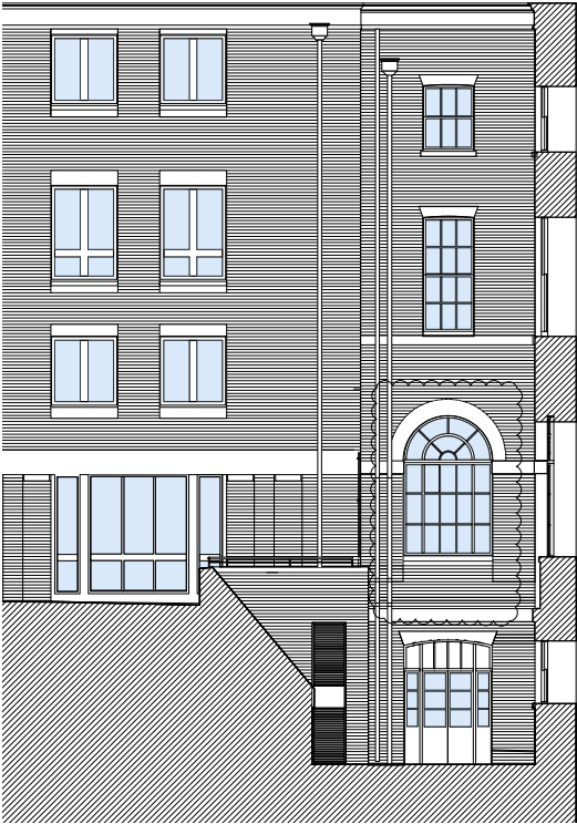
Sectional Elevation A 1:100 @ A1