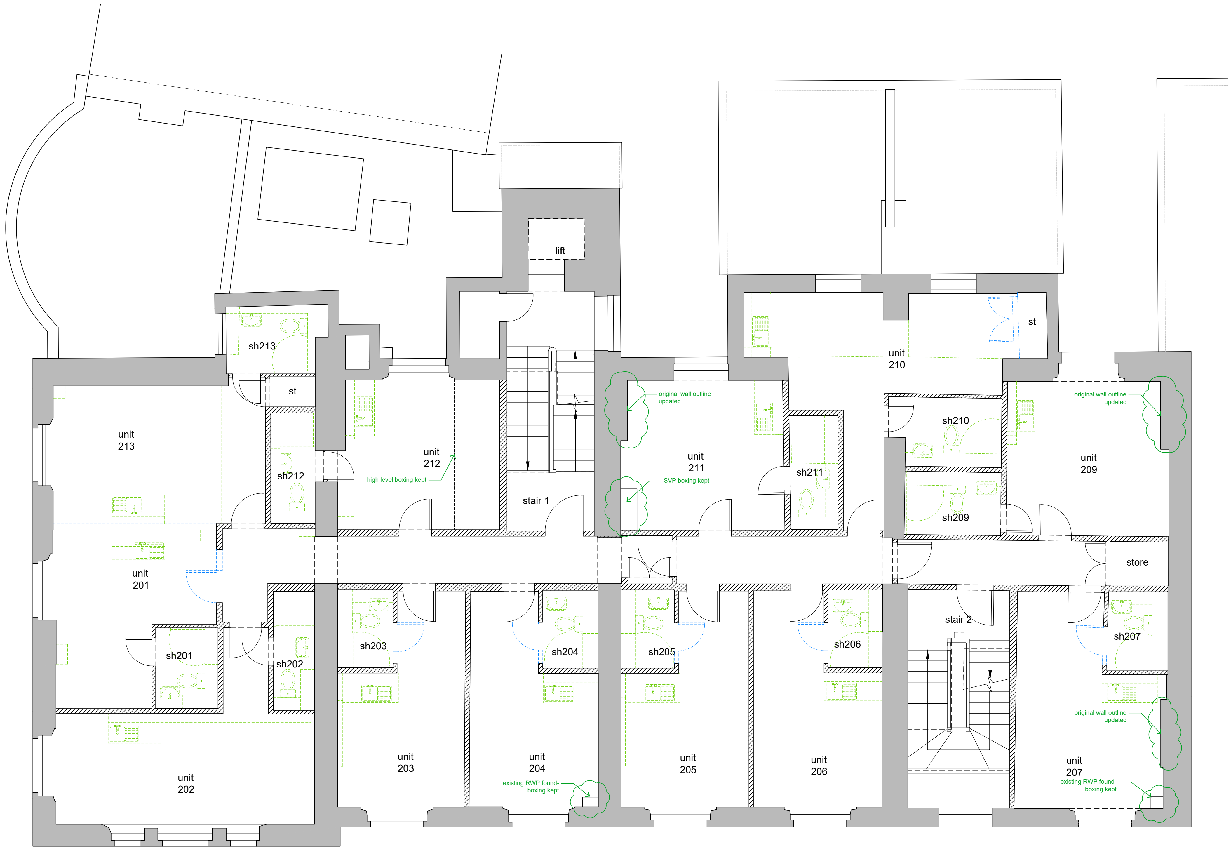
01 Existing second floor plan 1:50 @ A1 / 1:100 @ A3