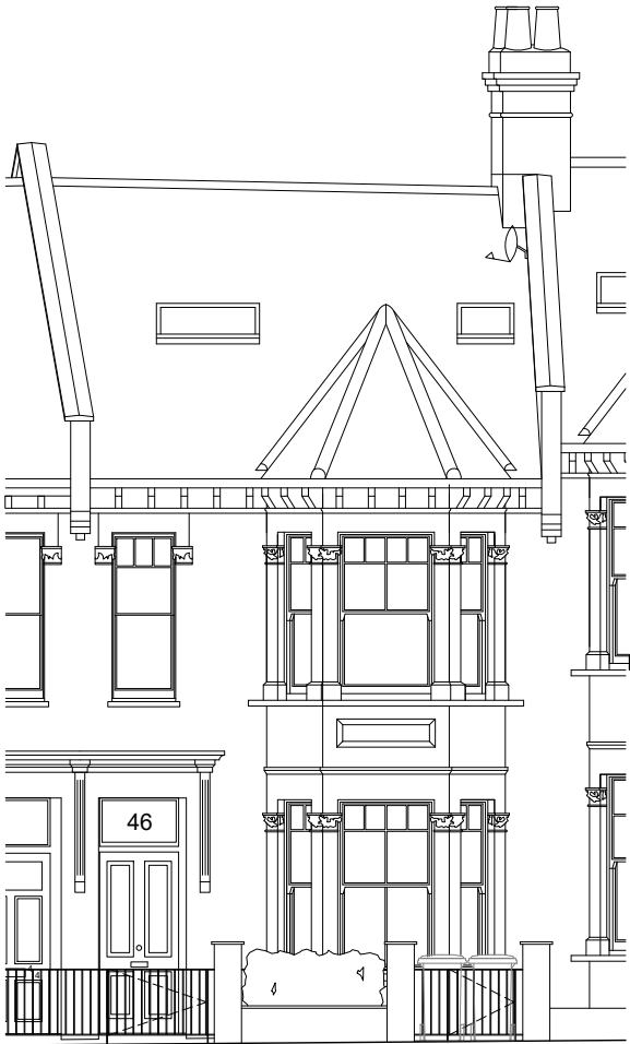
STREET ELEVATION @ 1:100