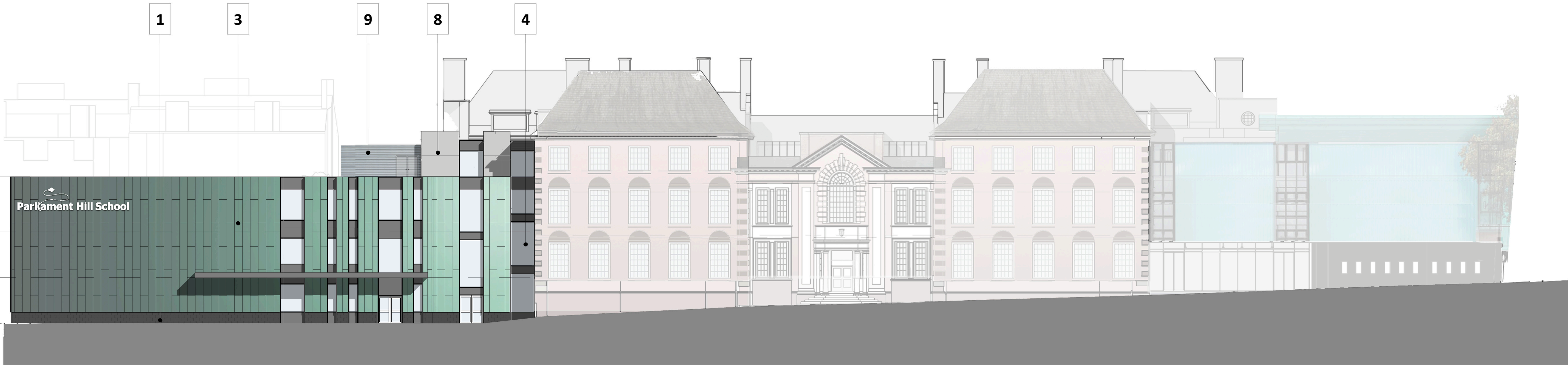
2. East - Building Line Elevation SCALE - 1 : 200@A1