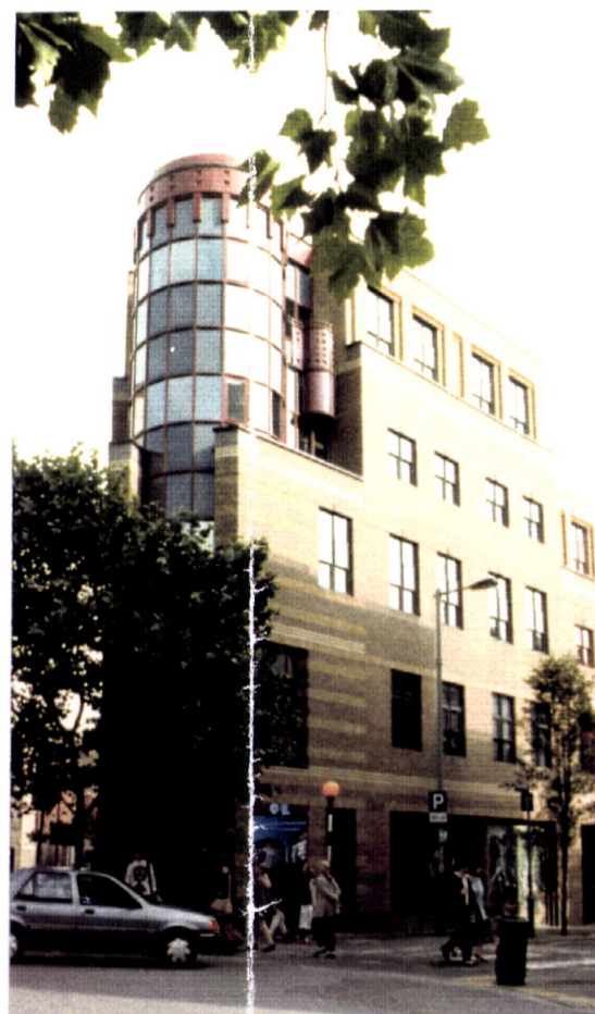
NORTH ONTO SEVEN DIALS