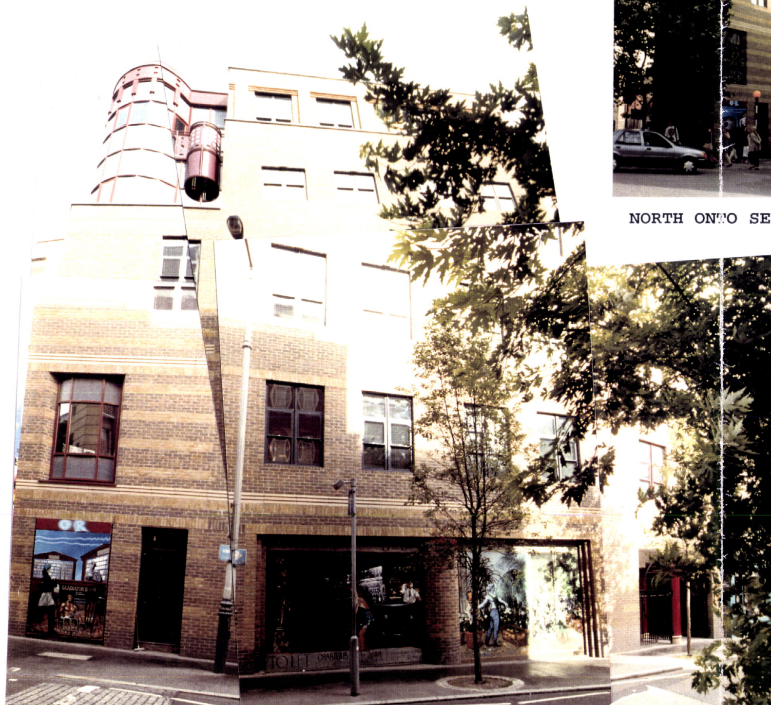
WEST ONTO MONMOUTH ST