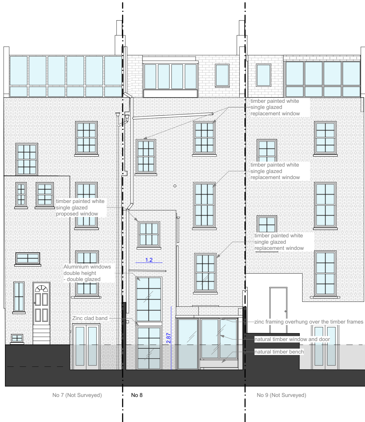
02 Proposed Rear Elevation Scale 1:100