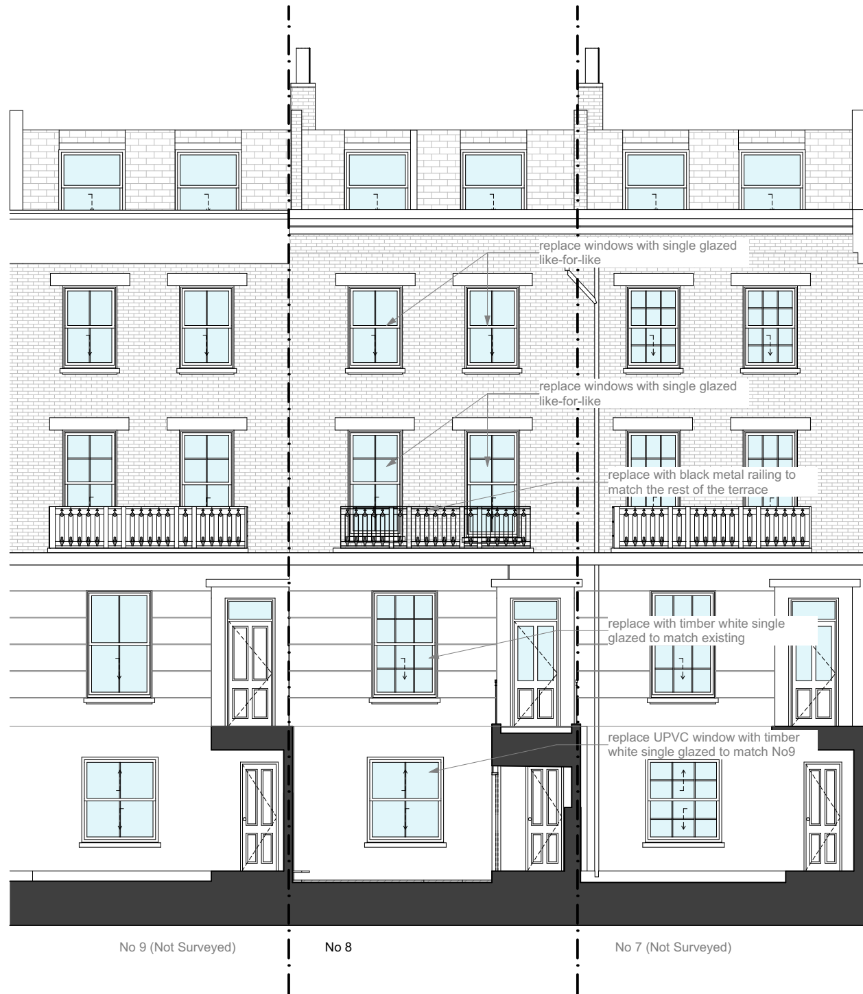
01 Proposed Front Elevation Scale 1:100