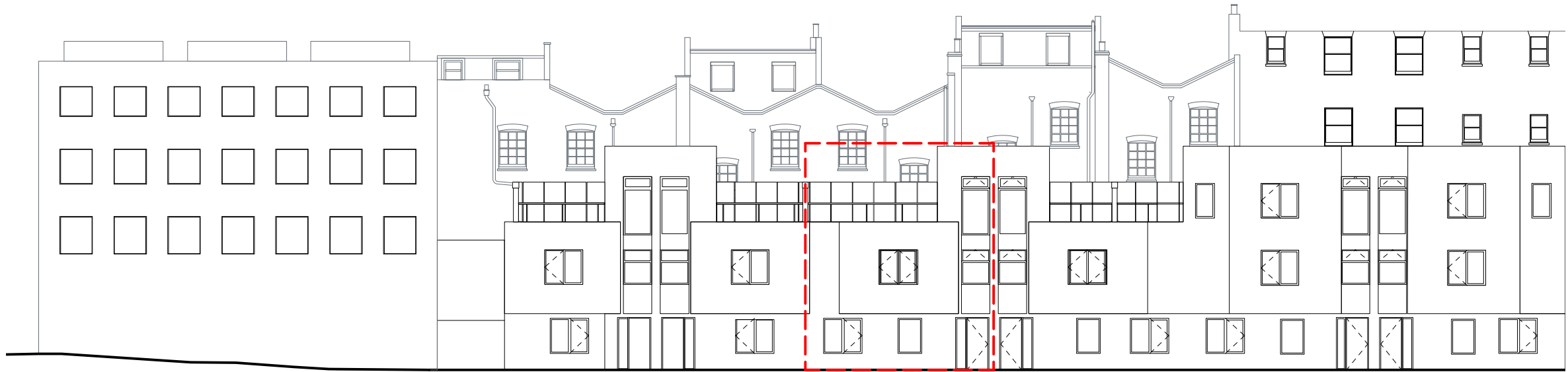
4 Existing North Elevation (Street Elevation) Scale: 1:200