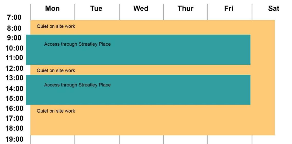
Weekly time table for site works