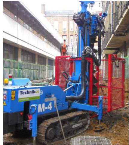
Example Miniature track dumper & pile drills