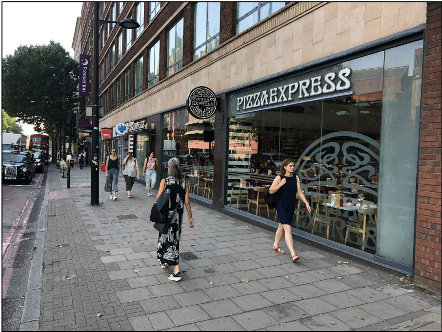
VIEW FROM EUSTON ROAD - RHS