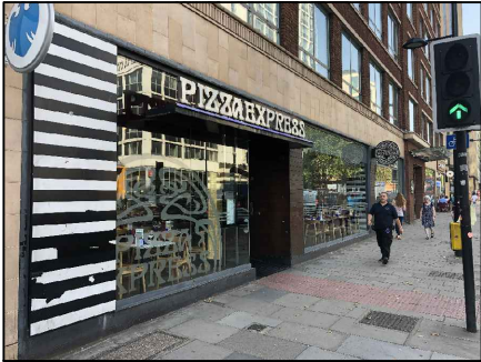
VIEW FROM EUSTON ROAD - LHS