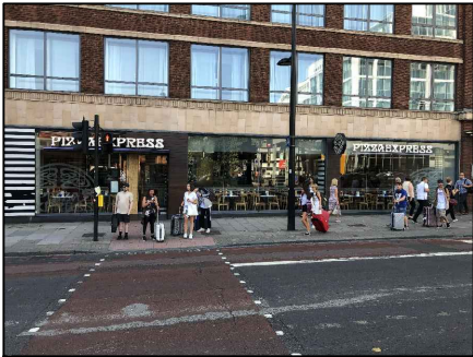
VIEW FROM EUSTON ROAD - FRONT