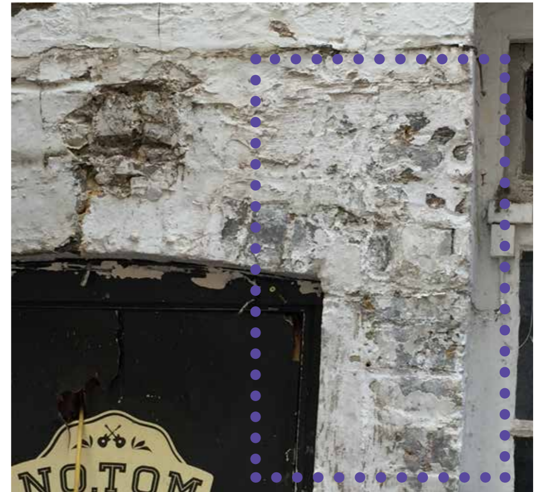
Area where test removal of paint has taken place