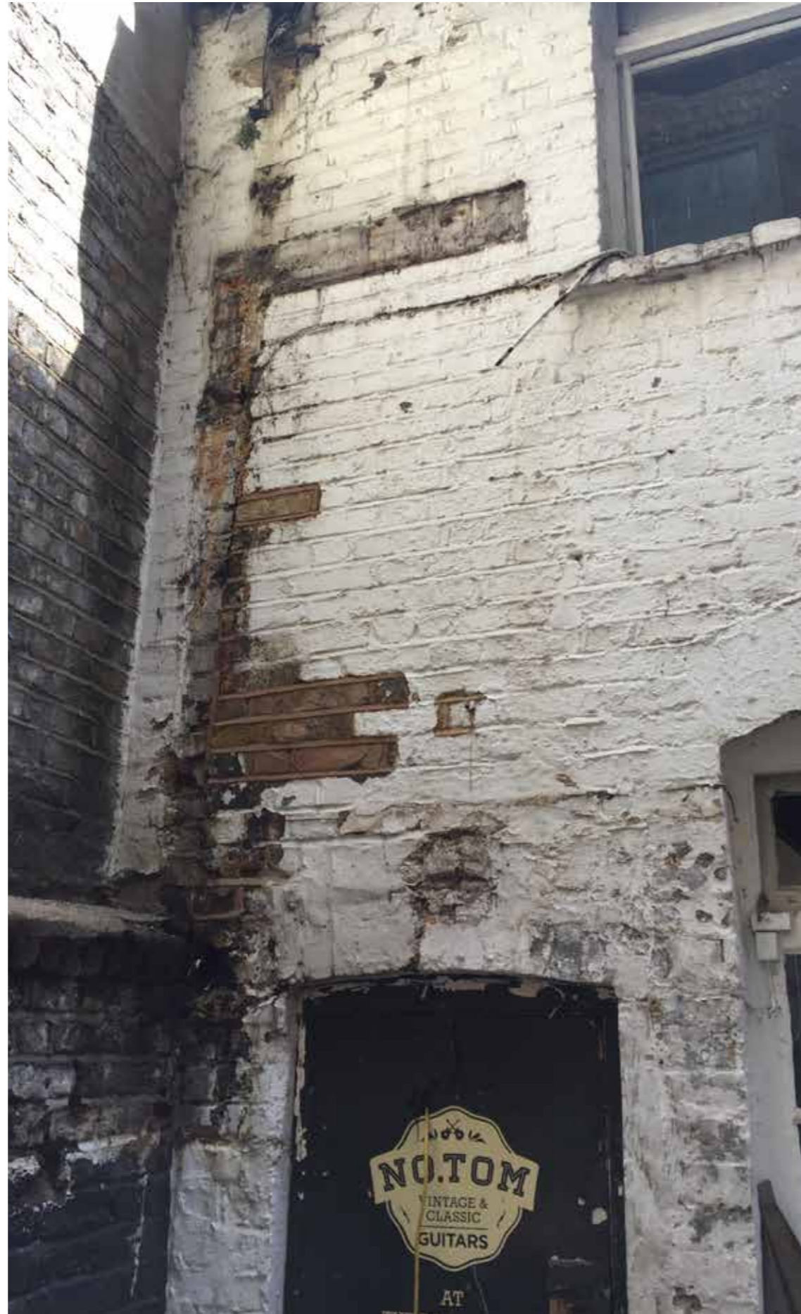
Exposed brickwork where existing services have been removed