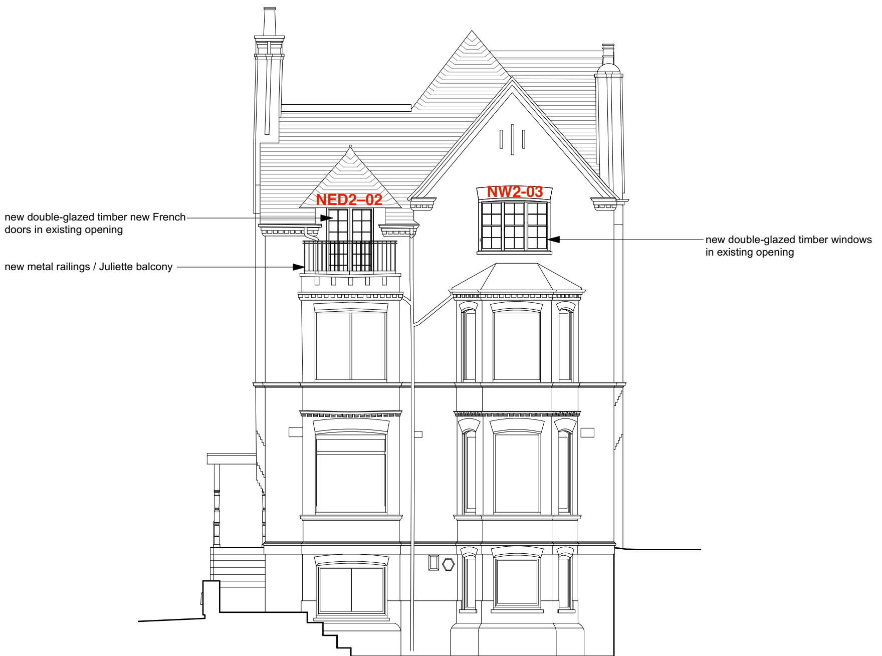
NORTH ELEVATION AS PROPOSED