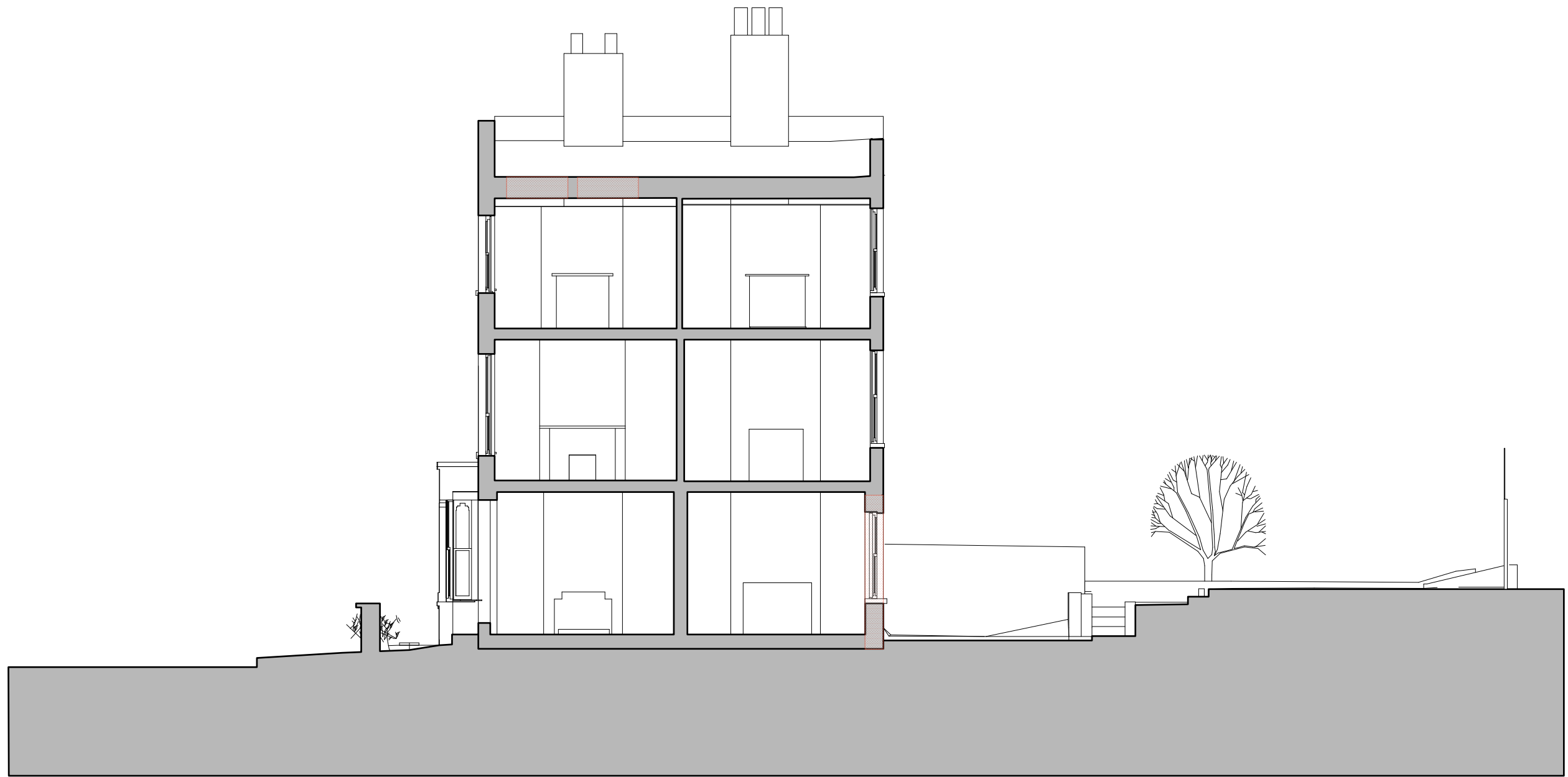
01: Existing Section B-B