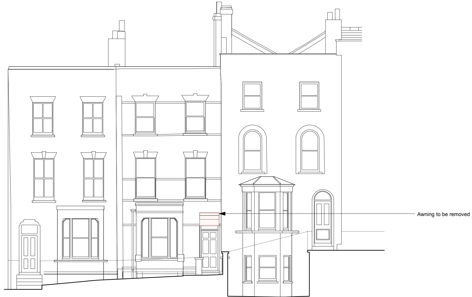
Application Site (No.24 Churchill Road)