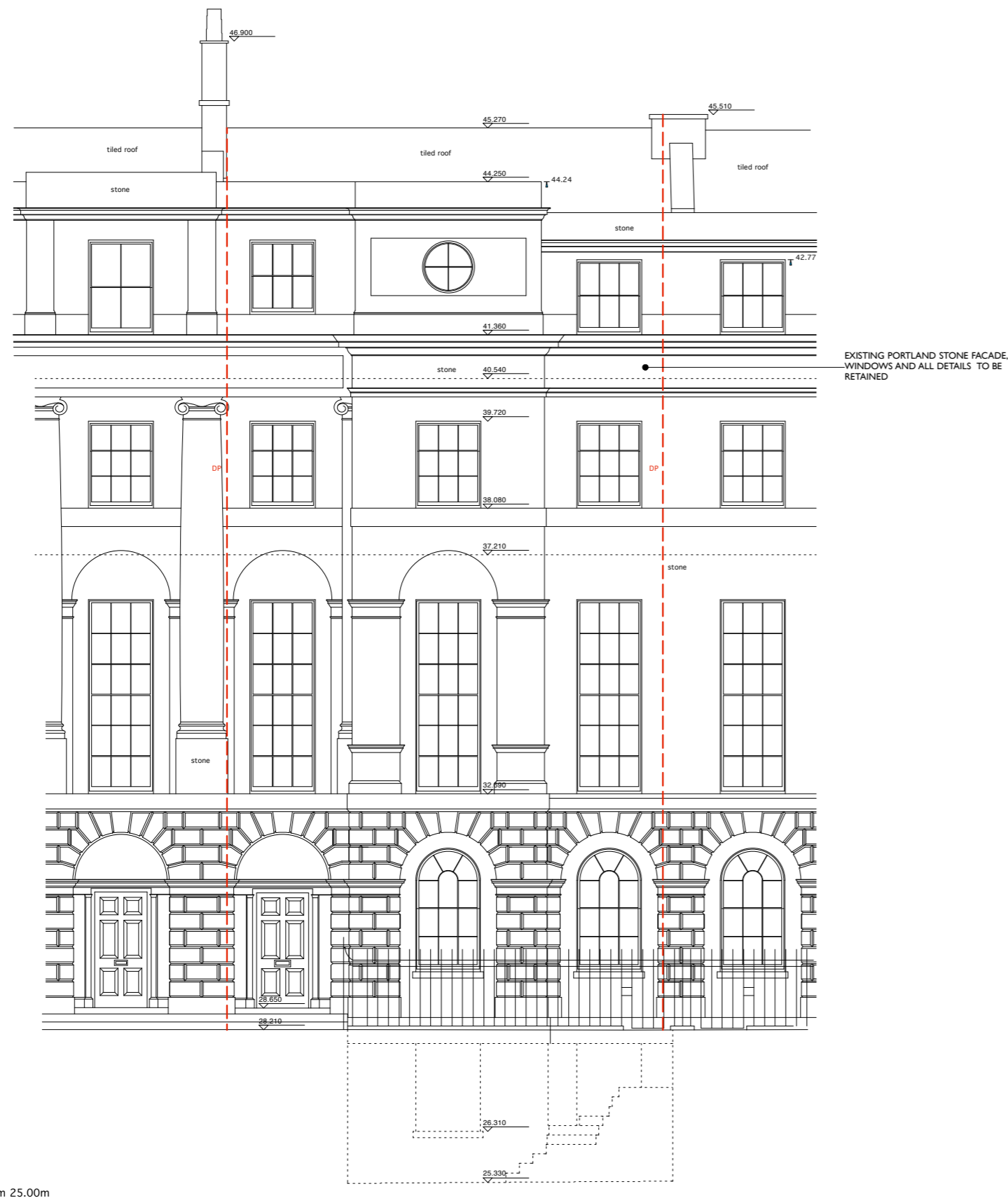
No.3 FITZROY SQUARE FRONT ELEVATION