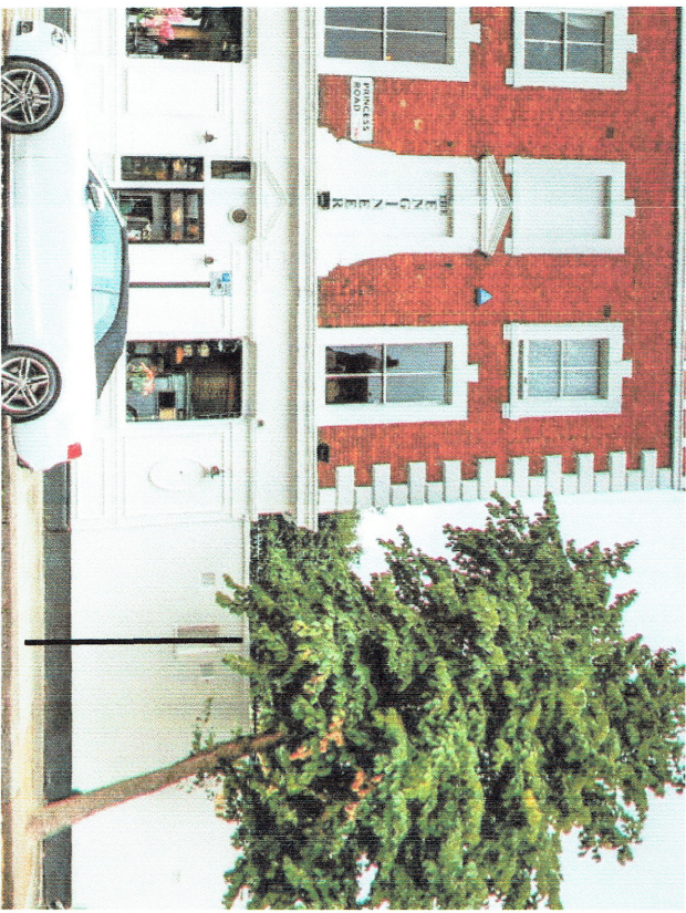
LOCATION B WITHOUT POLE