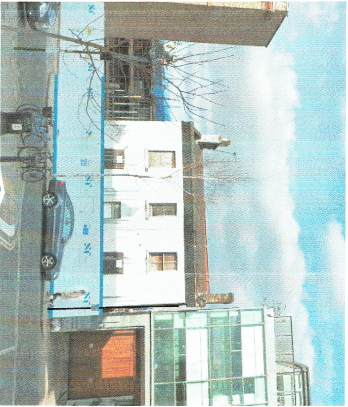
LOCATION A WITH POLE