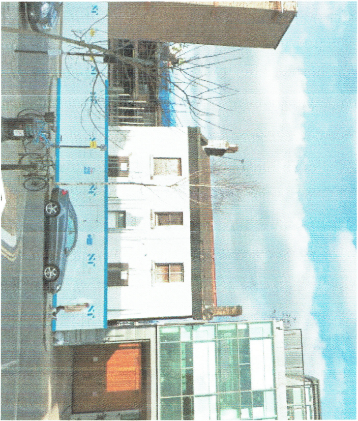
LOCATION A WITHOUT POLE