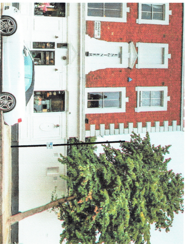
LOCATION B WITH POLE

The existing parking pole A to be replaced with a new, 5.5m high, 76dia pole at the rear of the footpath to the right of the main entrance to 40 Gloucester Crescent with a clear nylon filament extending across Gloucester Avenue to a matching pole at the rear of the footpath just beyond the rear of the Princess Road side elevation of The Engineer public house. Refix parking sign at existing height on the new poleA, remove existing parking pole and the pole approx 3 metres beyond it and reinstate the footpath paving.