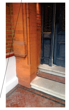
STONE TO PORCH STEPS TO MATCH EXISTING.

REV A EXISTING QUARRY TILES TO BE REPAIR AND MAKE GOOD.