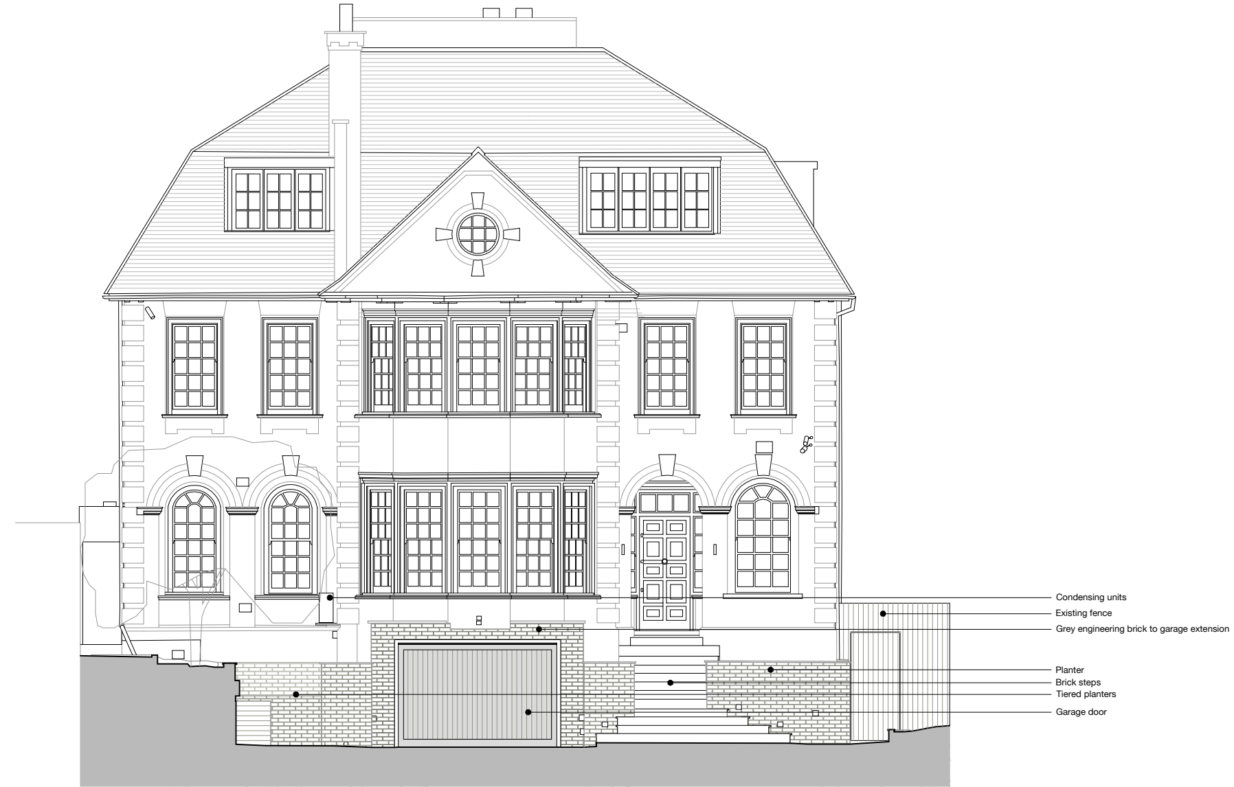
104.01 EXISTING ELEVATION 2 1:100 @ A3