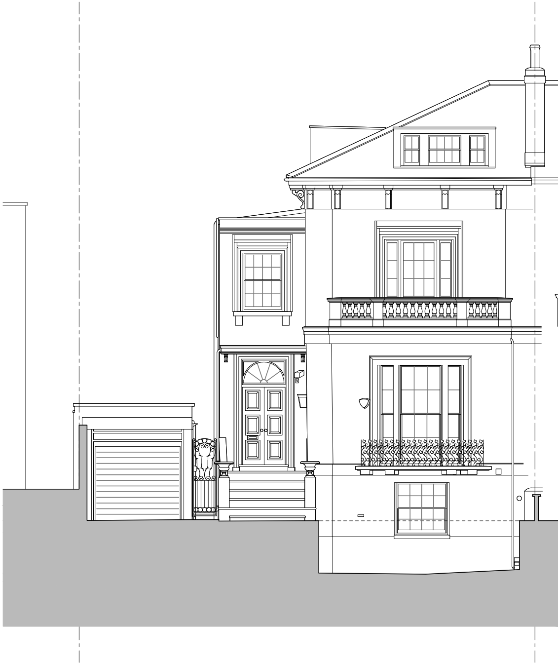
ELEVATION FRONT (SE) 1:100