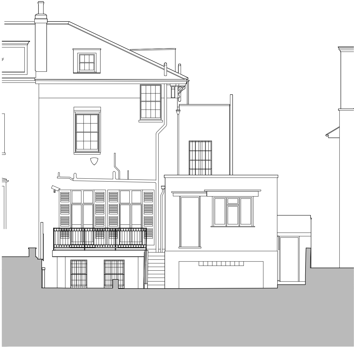
ELEVATION REAR (NW) 1:100

This drawing is the copyright of Red Squirrel AK Ltd. T/A Camouflage. Figured dimensions to be taken in preference to those scaled. All dimensions to be checked on site before any work proceeds. The contractor is to provide full size setting out drawings based on the information contained in this drawing for the designer approval prior to commencing manufacture. This drawing is issued on the condition that it is not reproduced, retained, or disclosed to any un-authorised person either wholly or in part without the consent in writing of: Camouflage, 8a Bartlett Street, Bath BA1 2QZ