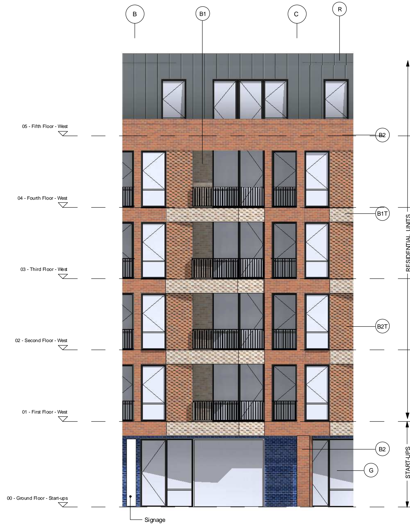
1 South Elevation - West Block - Bay Study 1 : 100