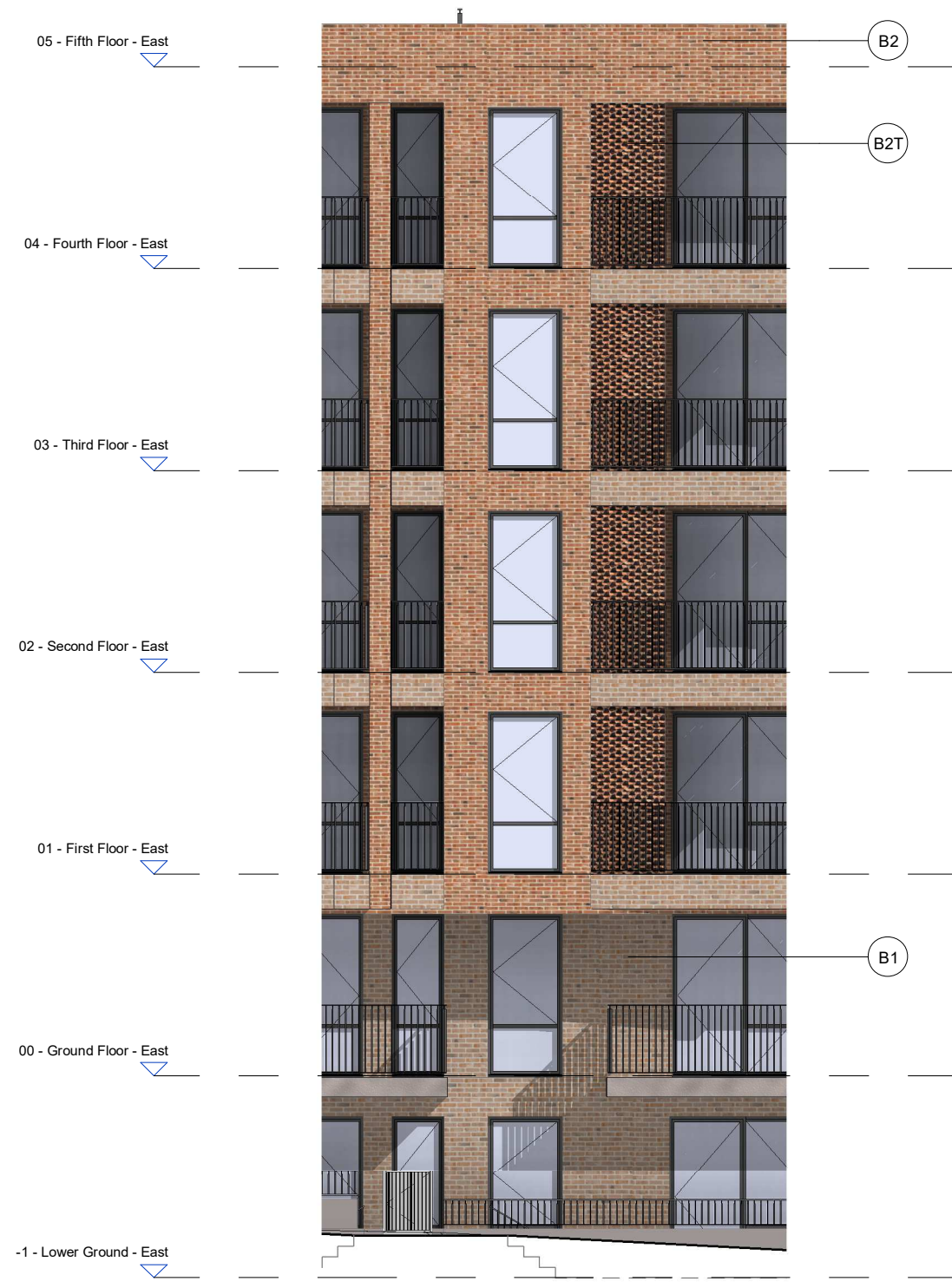
1 South Elevation - East Block - Bay Study 1 : 100