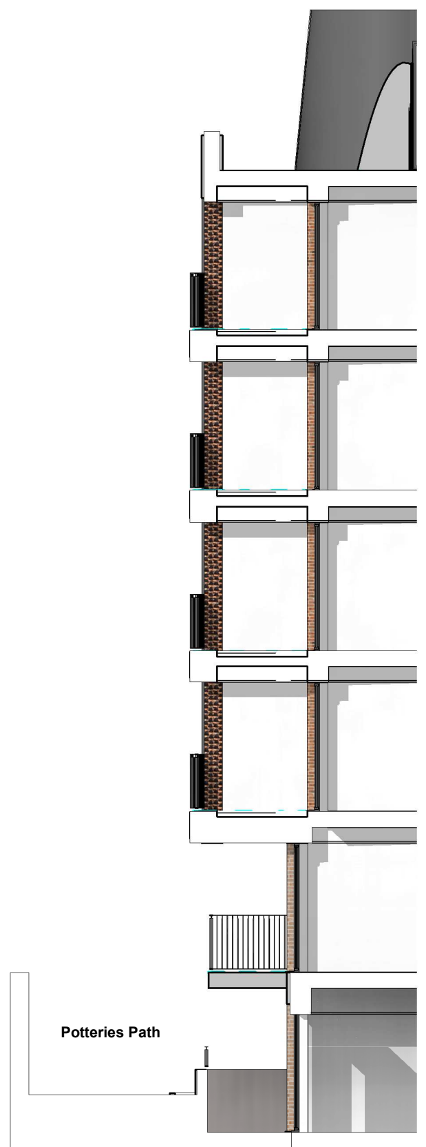
2 South Elevation (East Block) - Facade Section 1 : 100