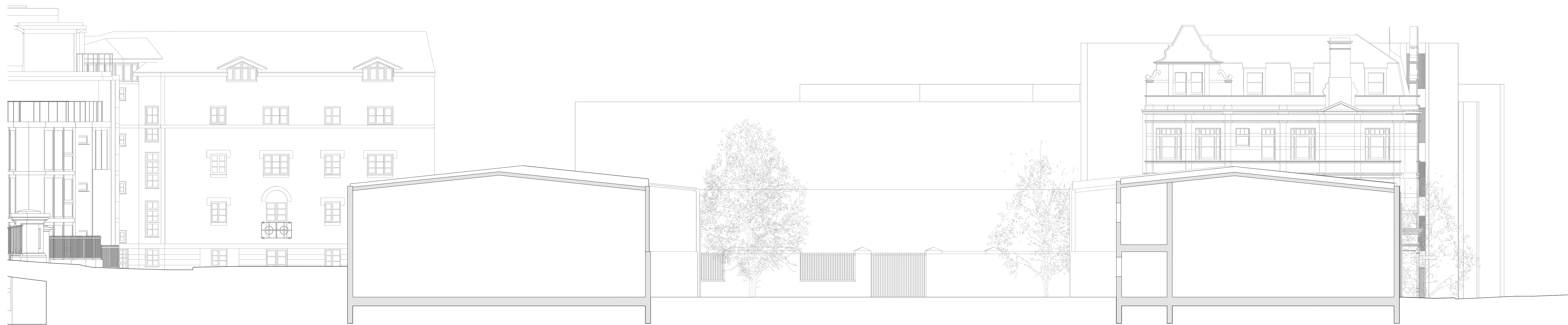
Existing Section - AA1