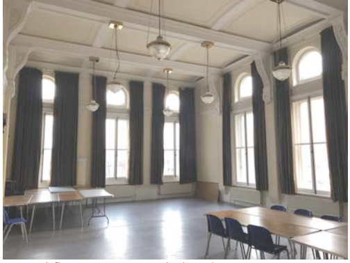
8. Vinyl flooring in Council Chamber