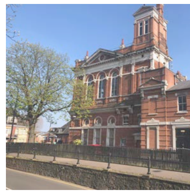
1. Belsize Avenue & north-west elevation