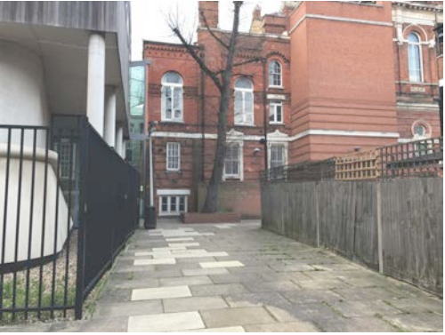
6. Pedestrianised route adjacent to 1999 extension