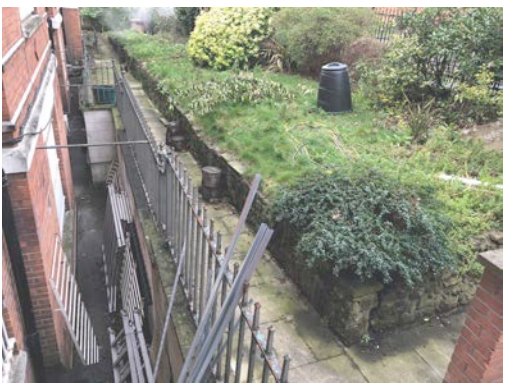
2. Path & Planting adjacent to north-west elevation