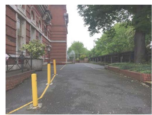
3. Car park and north-west elevation access