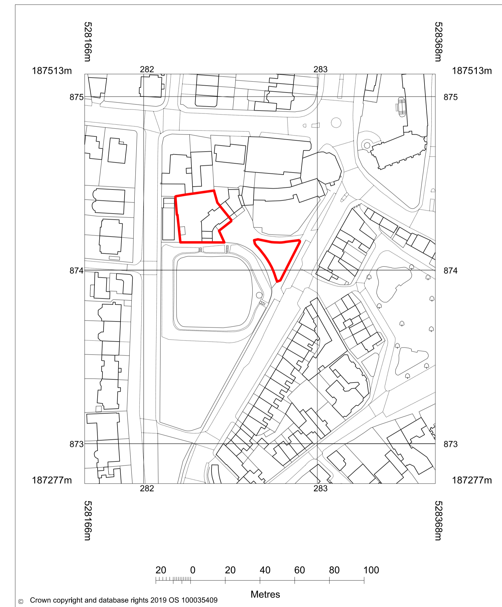
2 1:1250 SITE LOCATION PLAN - AS EXISTING