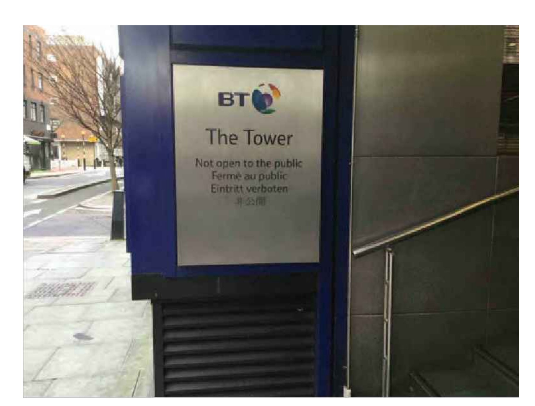
EXISTING MAPLE STREET