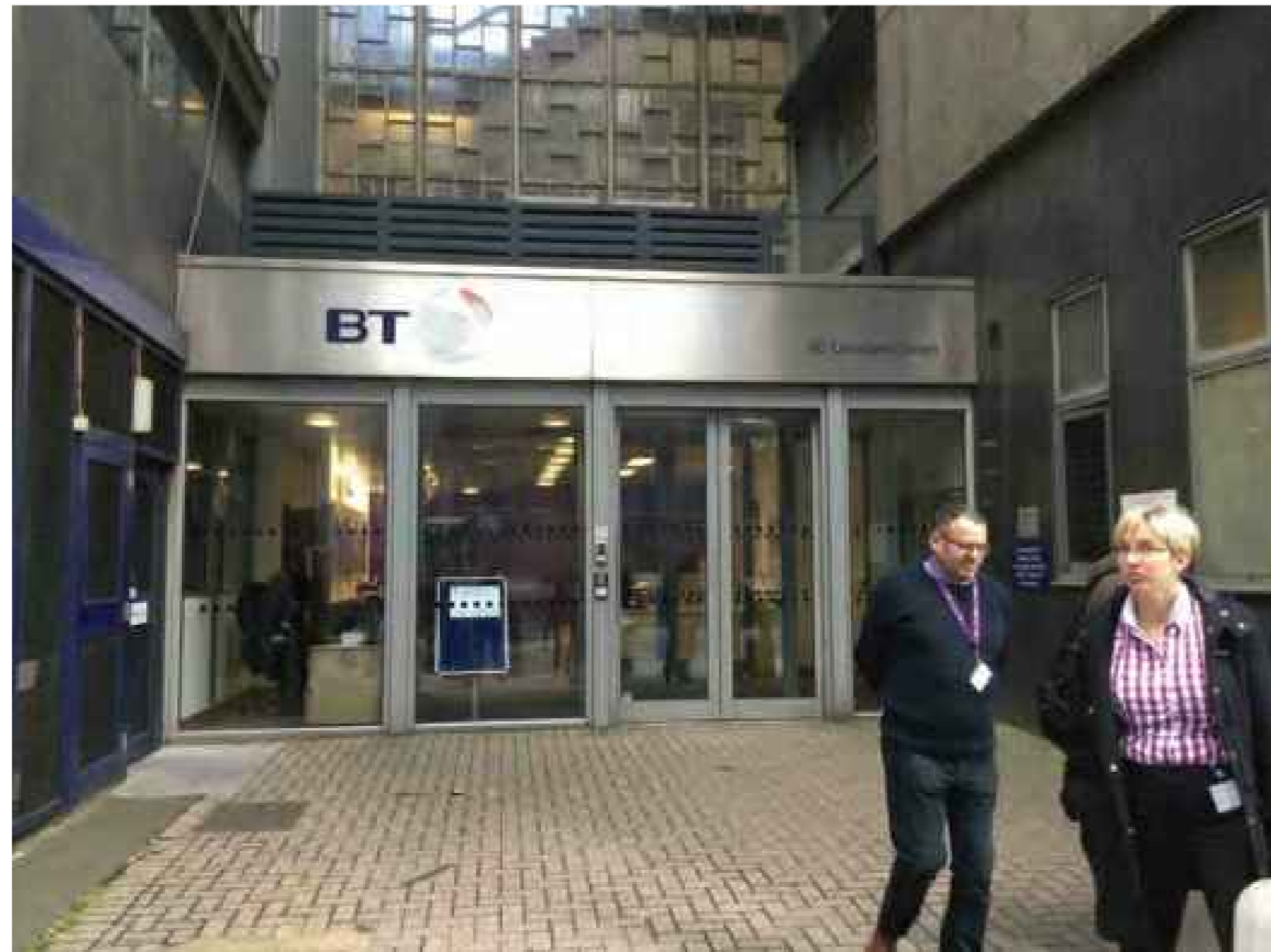
EXISTING CLEVELAND STREET

Scale 1:200 0 1m 2m 3m 4m 5m 6m 7m 8m 9m 10m