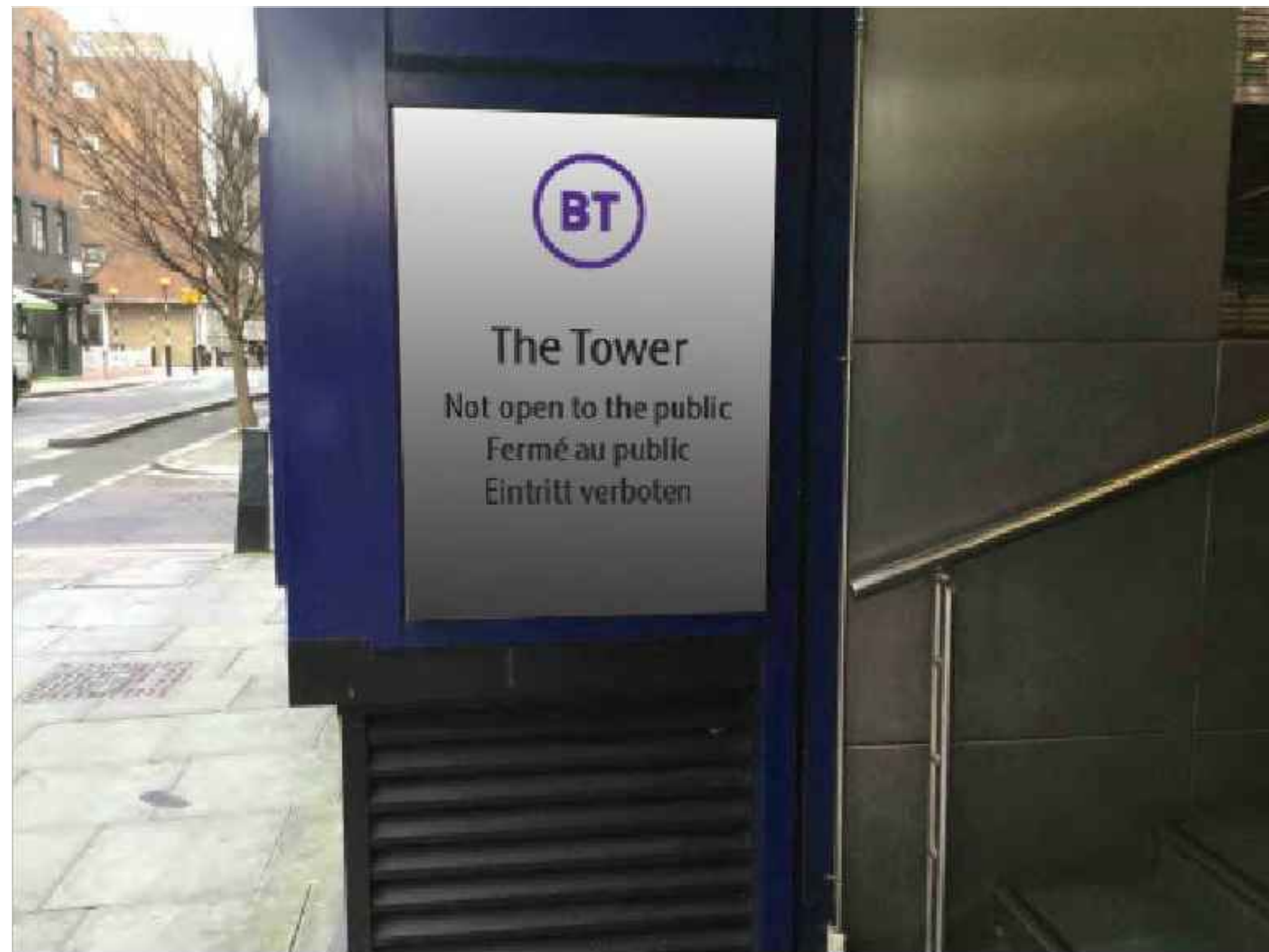
PROPOSED MAPLE STREET