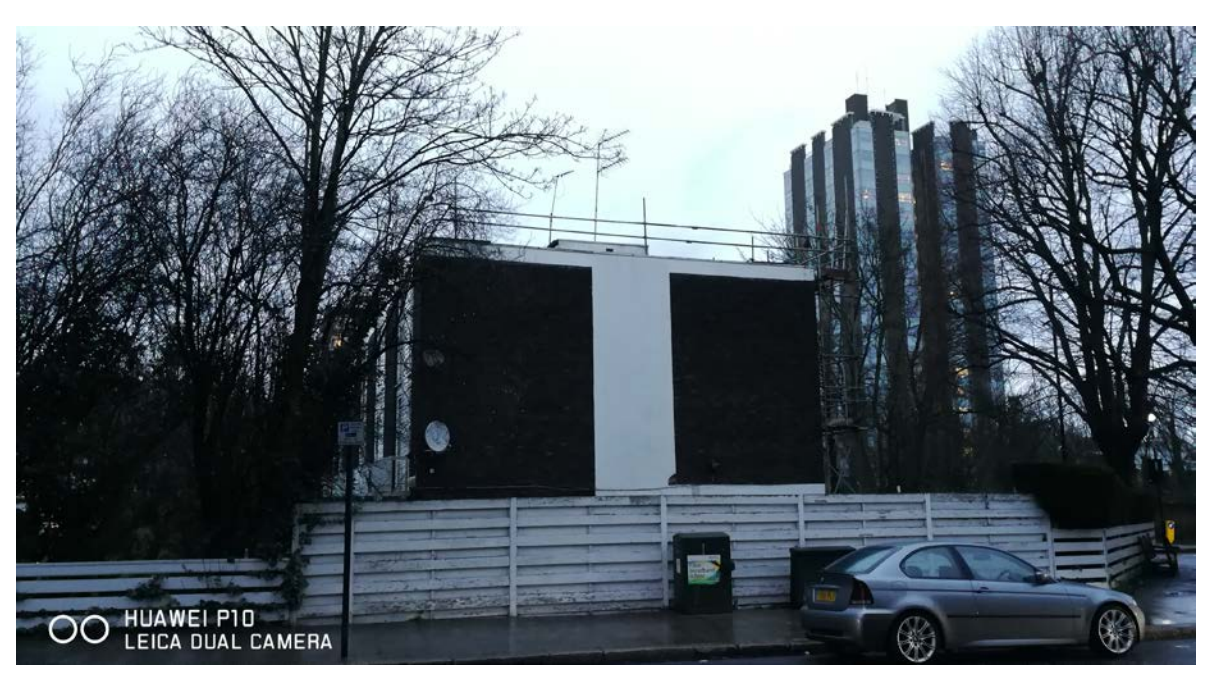
View from King Henry's Road