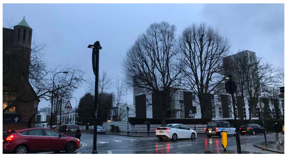
View from the junction of King Henry's Road and Primrose Hill Road

Furthermore, with this application, we would like to rectify the height and location of the existing boundary fence that was incorrectly drawn on the section drawing of the planning permission 2016/3956/P.