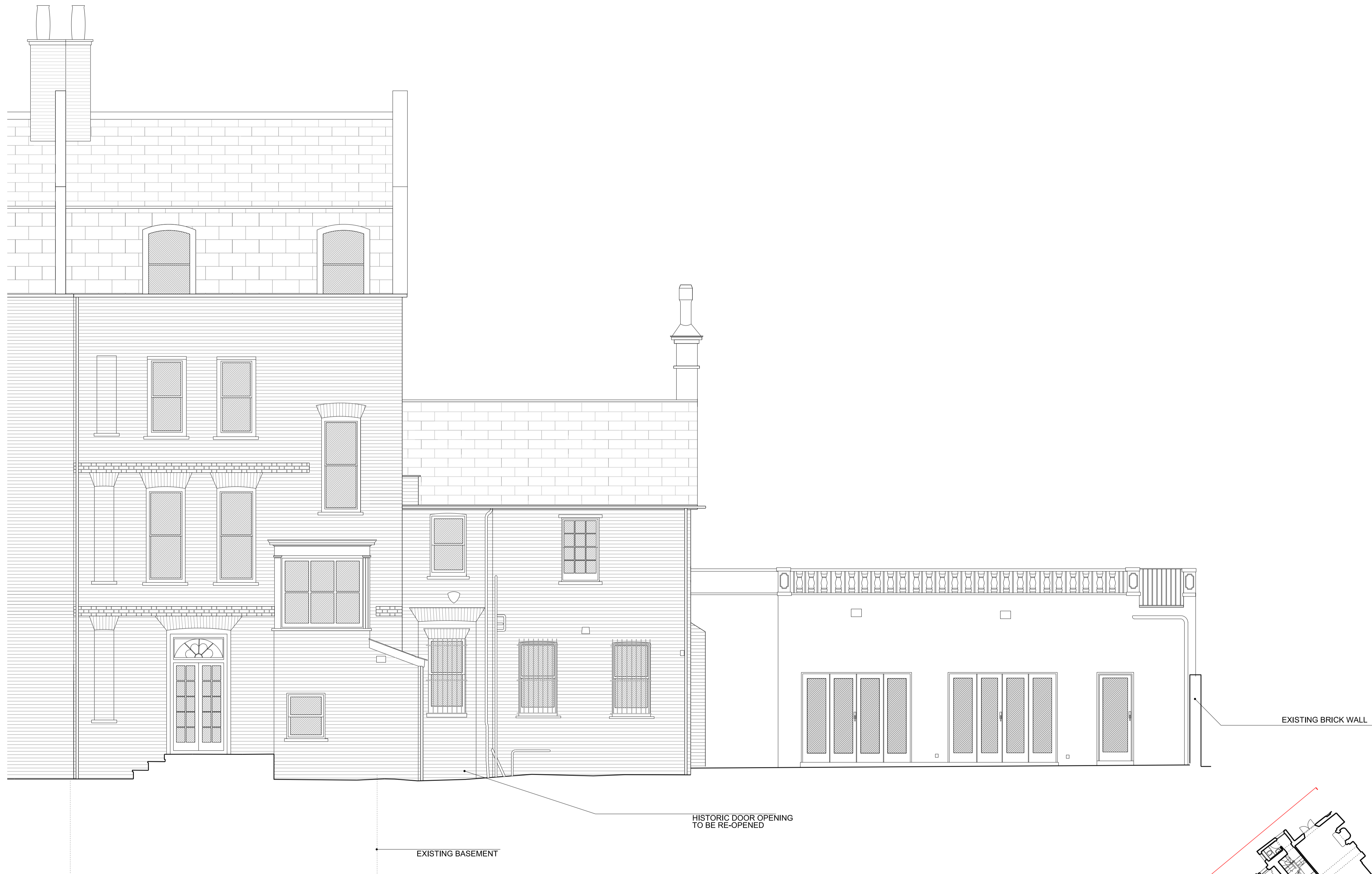
1 EXISTING REAR ELEVATION

DO NOT SCALE OFF THIS DRAWING. DIMENSIONS, AREA AND LEVELS ARE ONLY APPROXIMATE AND SUBJECT TO SITE SURVEY. ALL DIMENSIONS TO BE CHECKED ON SITE. ANY DISCREPANCIES OR VARIATIONS TO BE REPORTED TO THE ARCHITECT BEFORE WORK COMMENCES. THIS DRAWING IS TO BE READ IN CONJUNCTION WITH THE SPECIFICATION WHERE PROVIDED AND ALL RELEVANT CONSULTANTS DRAWINGS AND FOR SPECIALISTS DRAWINGS (DOCUMENTS AND ANY DISCREPANCIES OR VARIATIONS ARE TO BE REPORTED TO THE ARCHITECT BEFORE THE AFFECTED WORK COMMENCES. THIS DRAWING IS PROTECTED BY COPYRIGHT AND MUST NOT BE COPIED OR REPRODUCED WITHOUT THE WRITTEN CONSENT OF CHRIS DYSON ARCHITECTS LLP. NORTH POINTS SHOWN ARE INDICATIVE. ©