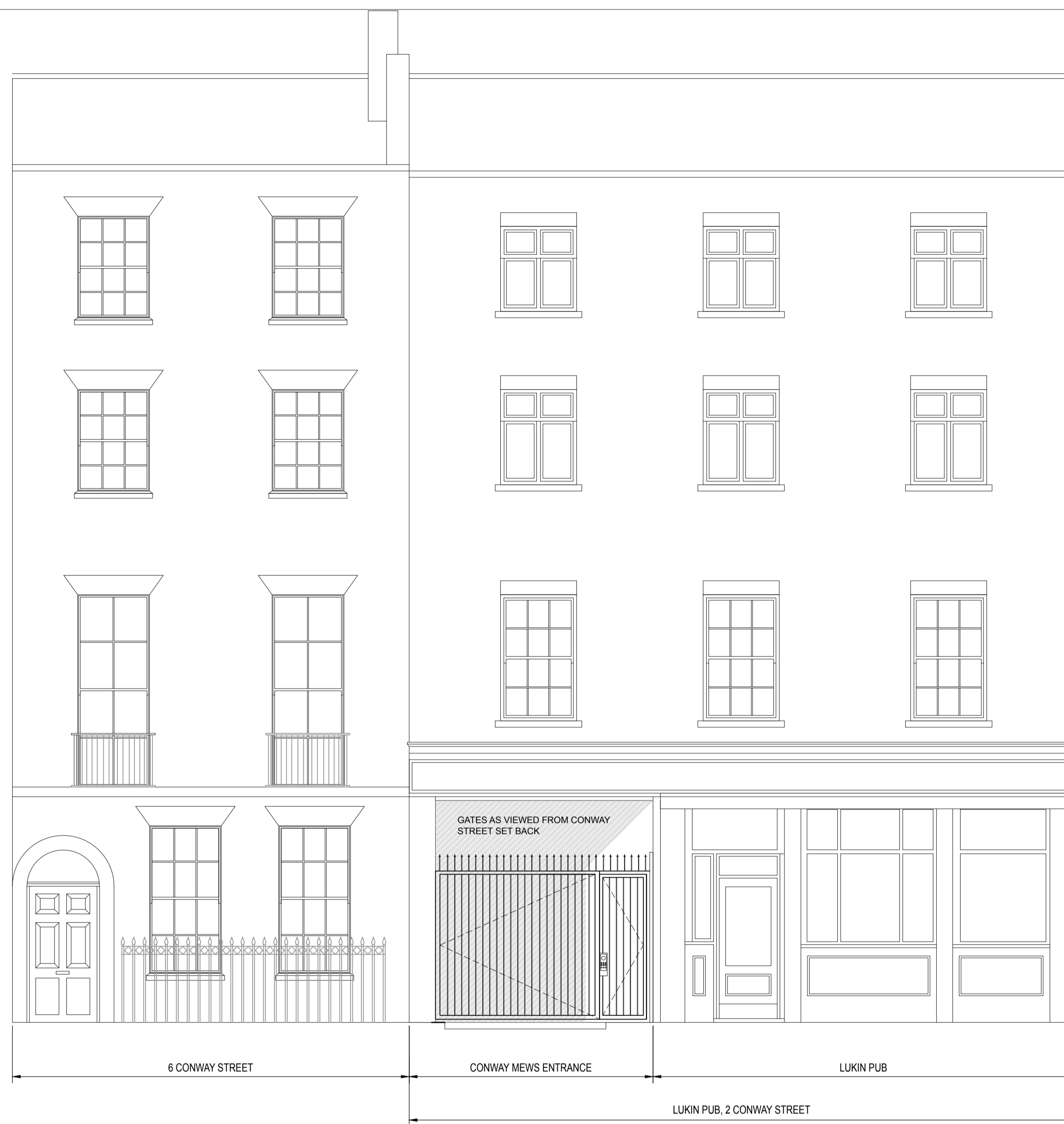
PROPOSED ELEVATION AA FROM CONWAY STREET 1:50 @A1 OR 1:25 @A3