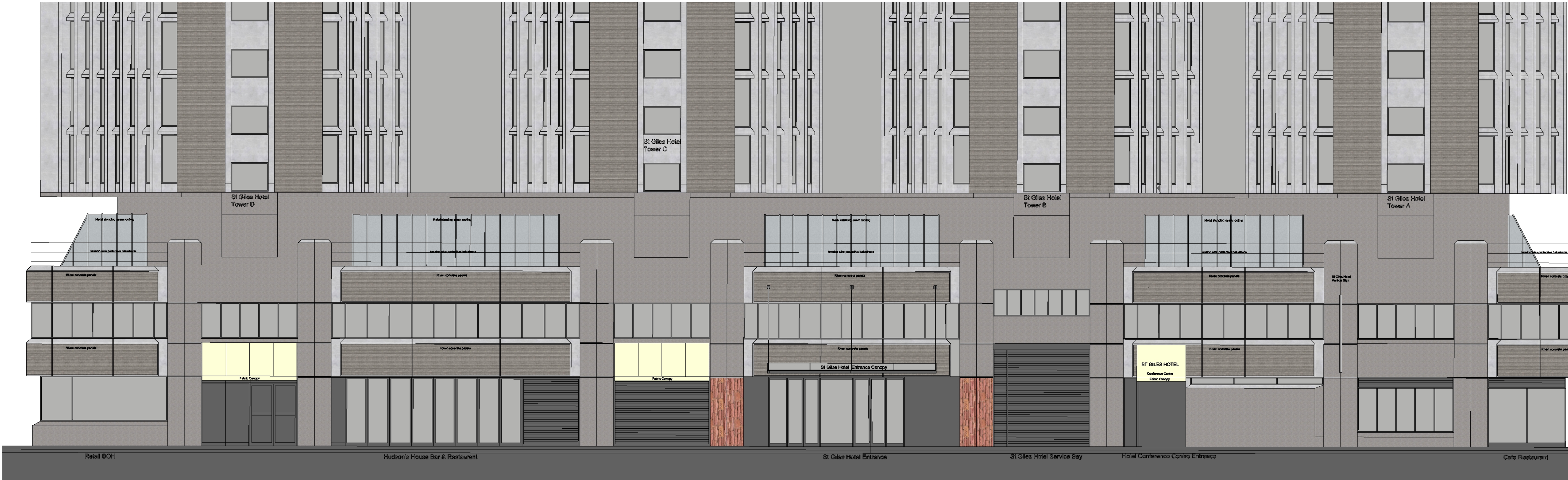
Existing Elevation PA-AF-EE 002