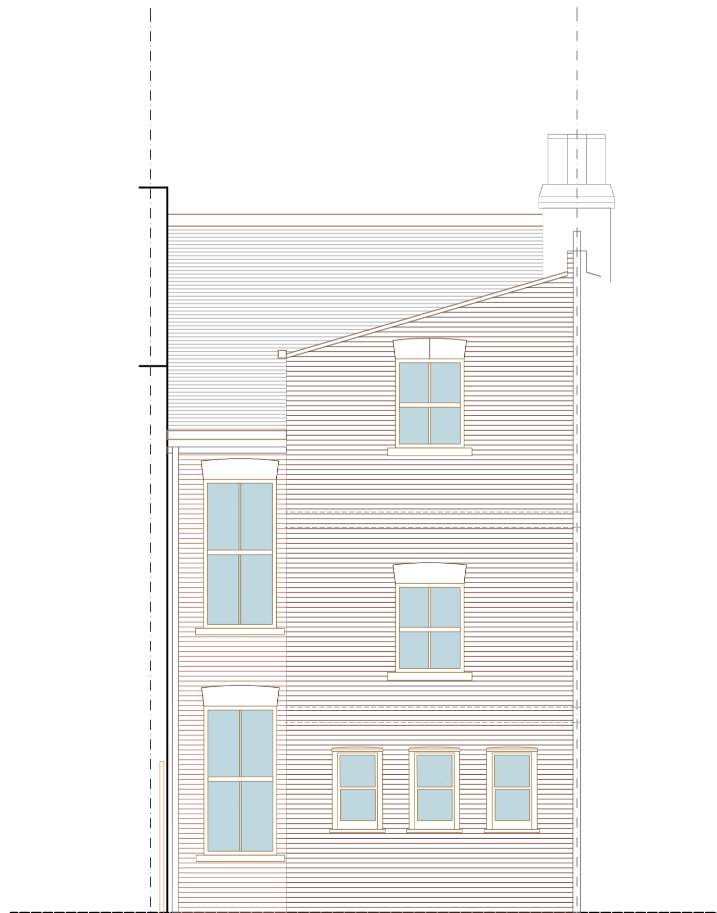
ELE EXISTING REAR ELEVATION Scale: A3 1:100 A1 1:50