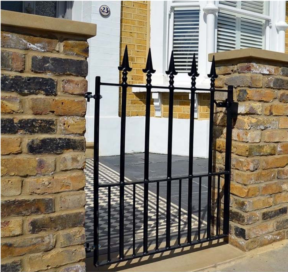
Precedent image of metal railings, brick wall and piers

PLANNING APPLICATION 251 GOLDHURST TERRACE Detail of Front Brick Wall Gates and Railings