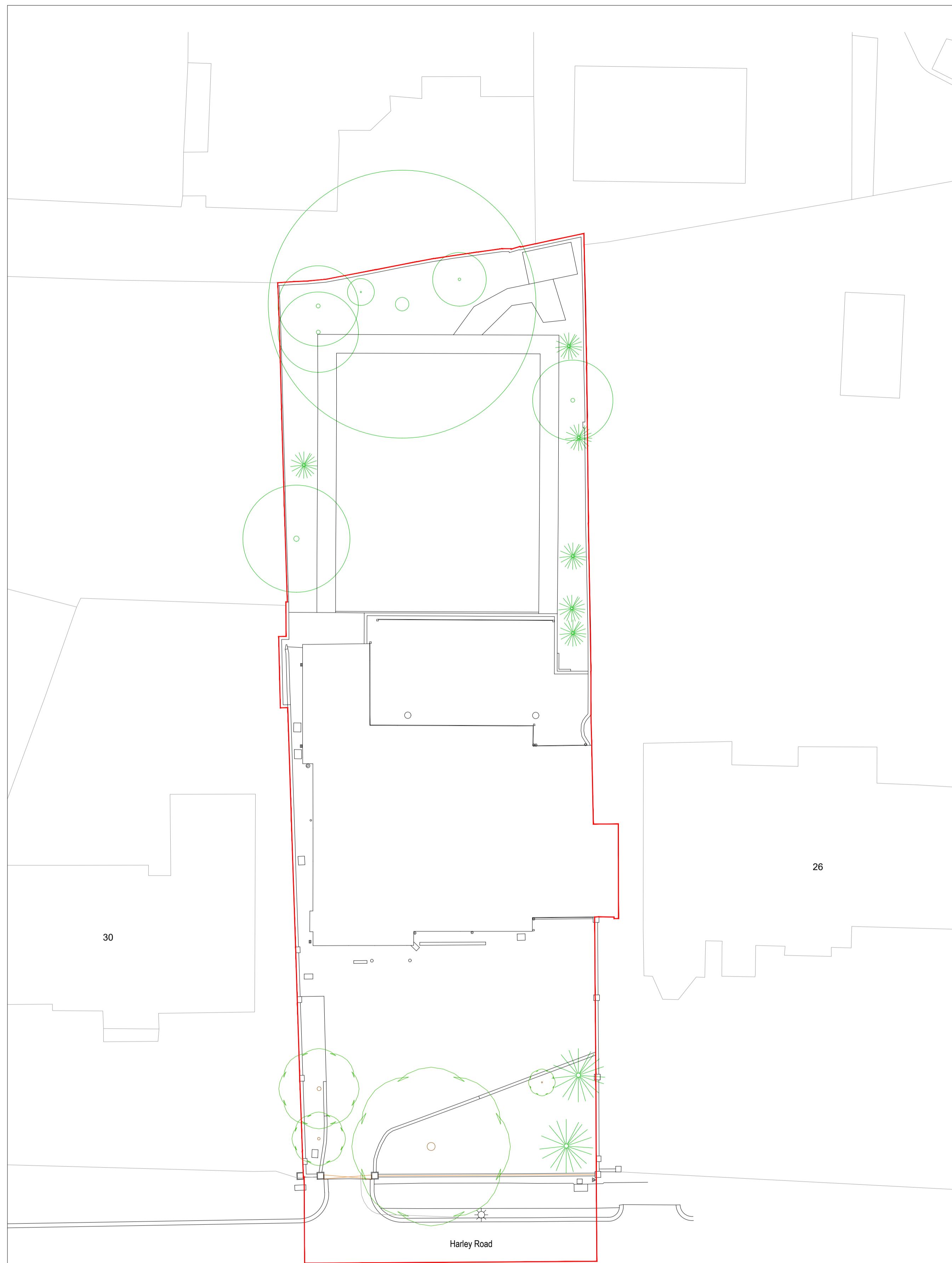
Existing Site Plan SCALE 1:200@A1