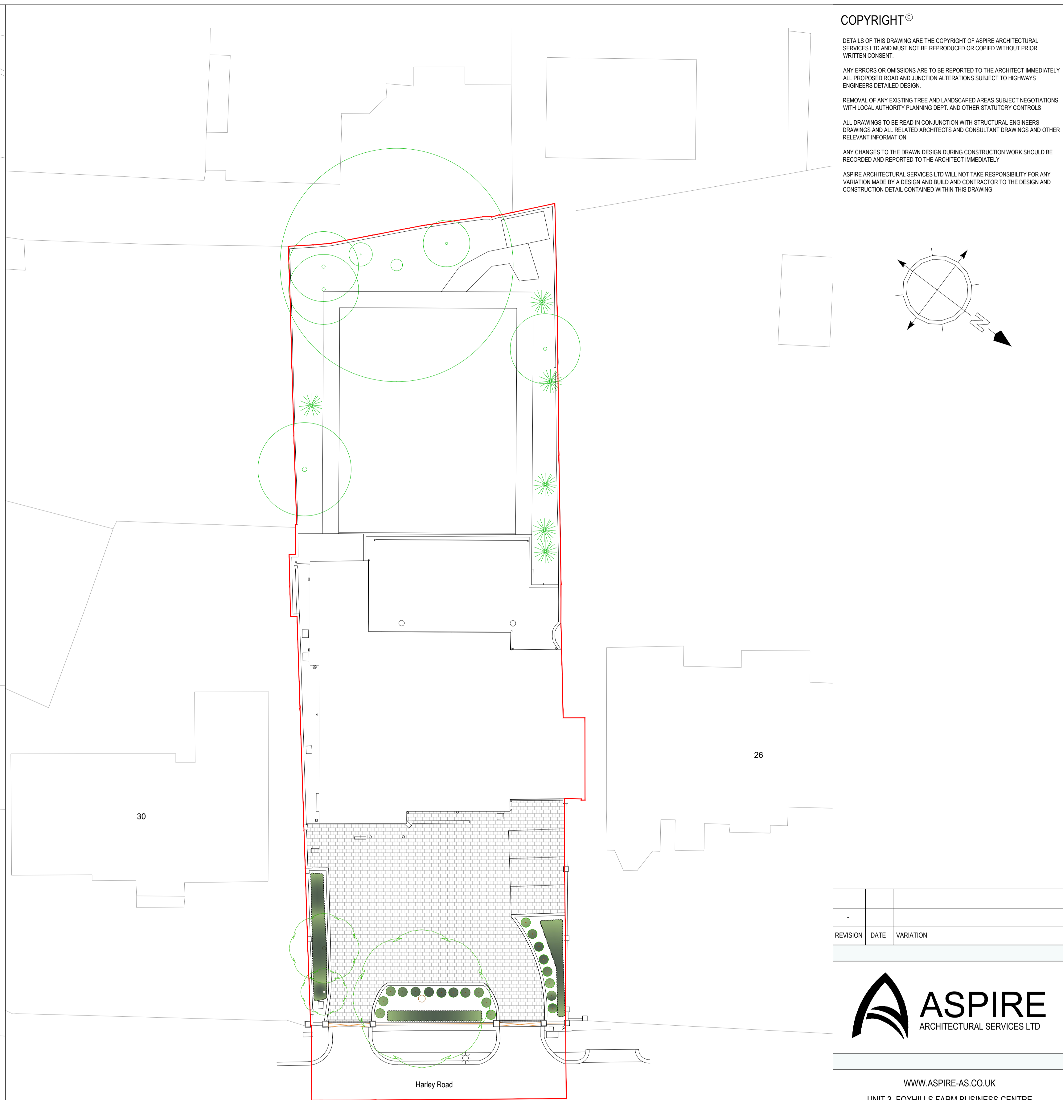
Proposed Site Plan SCALE 1:200@A1