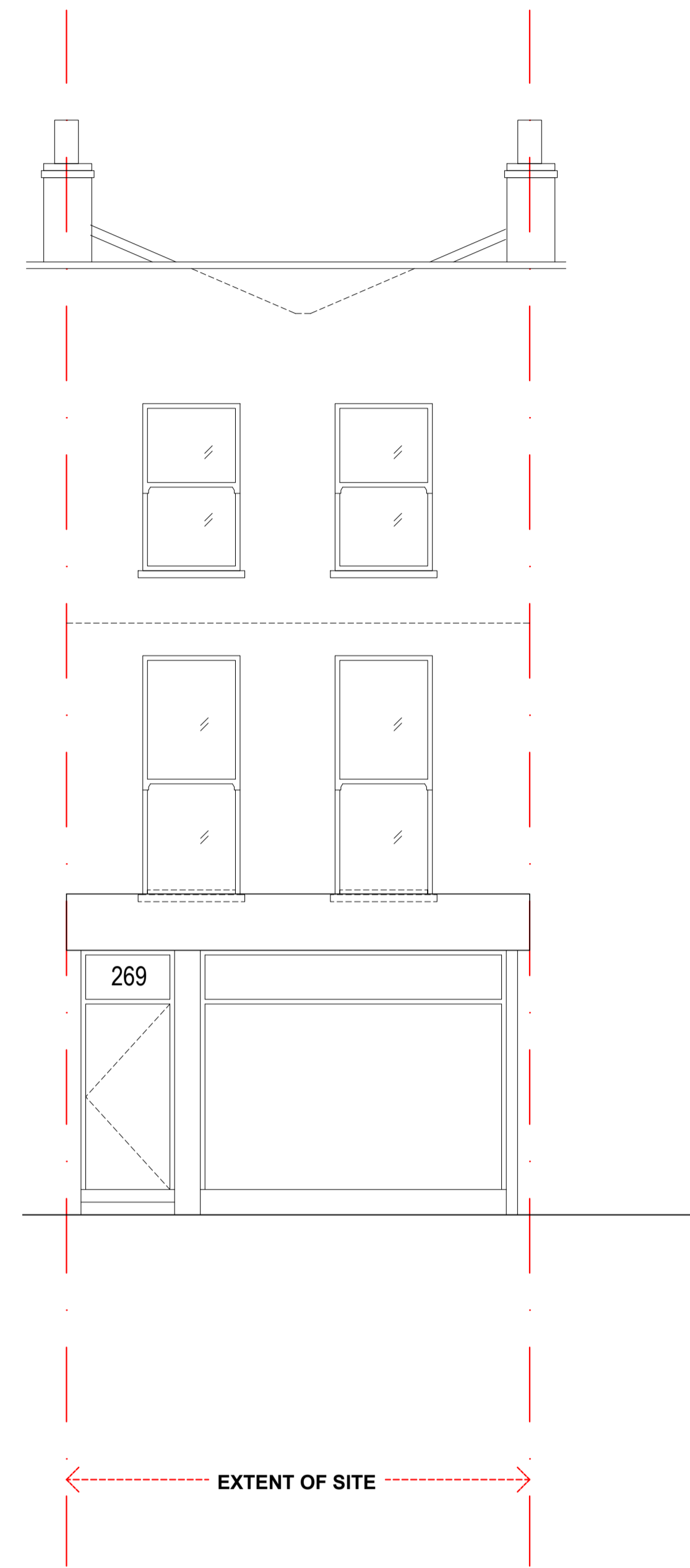
2 EXISTING FRONT ELEVATION SCALE 1:50