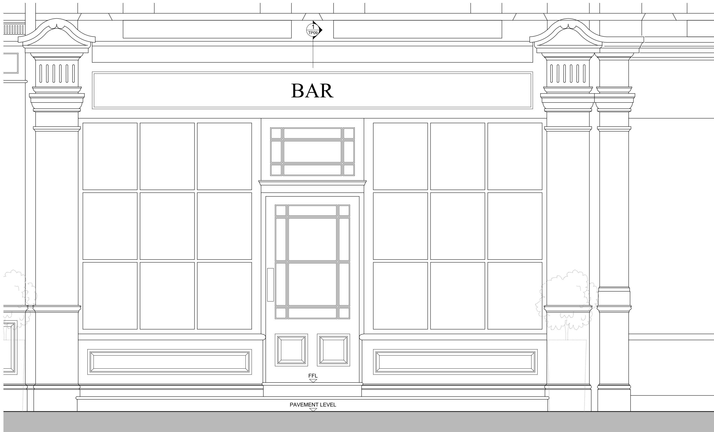
1 EXISTING DETAIL ELEVATION AWNING SHOWN RETRACTED